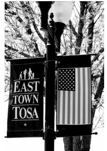
A strong North Avenue in East Tosa is better for everyone.

Going forward it is imperative that we continue to work with the plan to draw the businesses and services that we want and need and owners and developers willing to invest in that plan. A strong North Avenue in East Tosa is better for everyone.