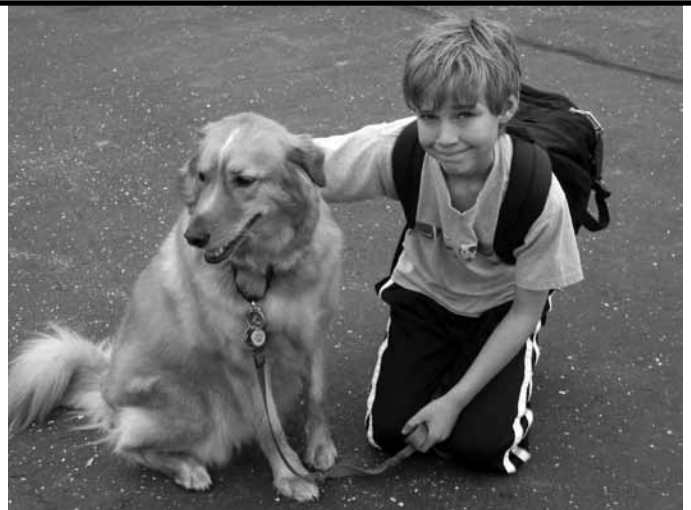
Dog-walking is a great way for neighborhood kids to earn money.

Likewise, we get emails and phone calls all the time for in-home daycare, to which we have no answer because they are not listed in the phone book... If you have an in-home daycare and would like to be on a list for incoming families or families that are heading back to work, we would love to be able to send potential opportunities your way!