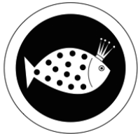
Maxie's Southern Comfort

Live Cooking Demonstrations from the following restaurants: