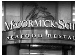
McCormick & Schmick's