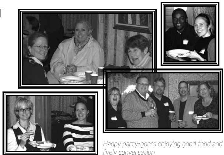
Happy party-goers enjoying good food and lively conversation.

Thank you to all that worked to bring this together, and thanks to those that attended. We hope to see you next year!