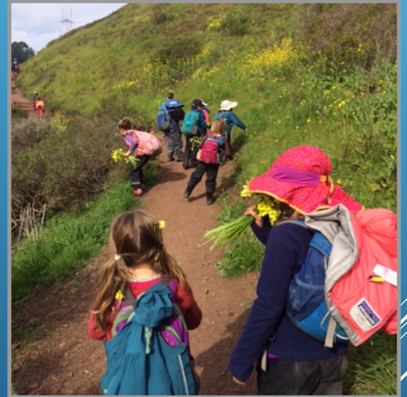
Early Education Survey, 2017