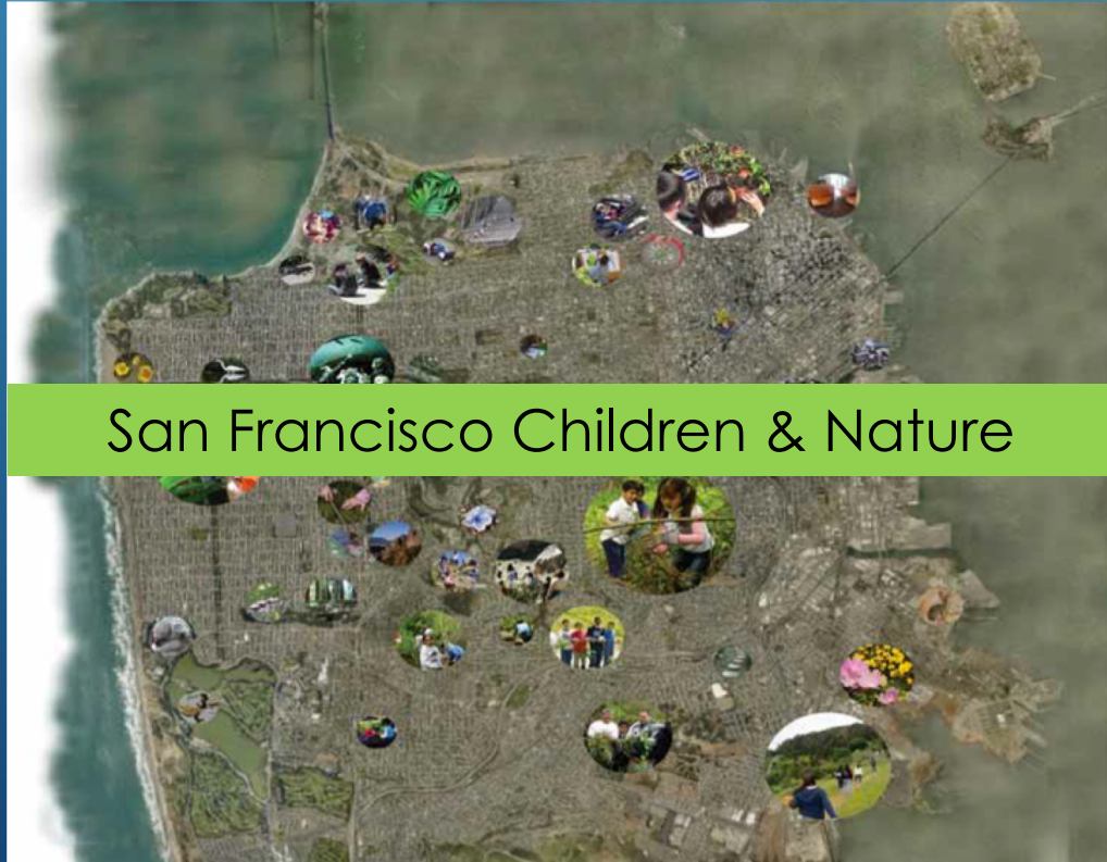
San Francisco Children & Nature

Collective Impact Convening April 3, 2018