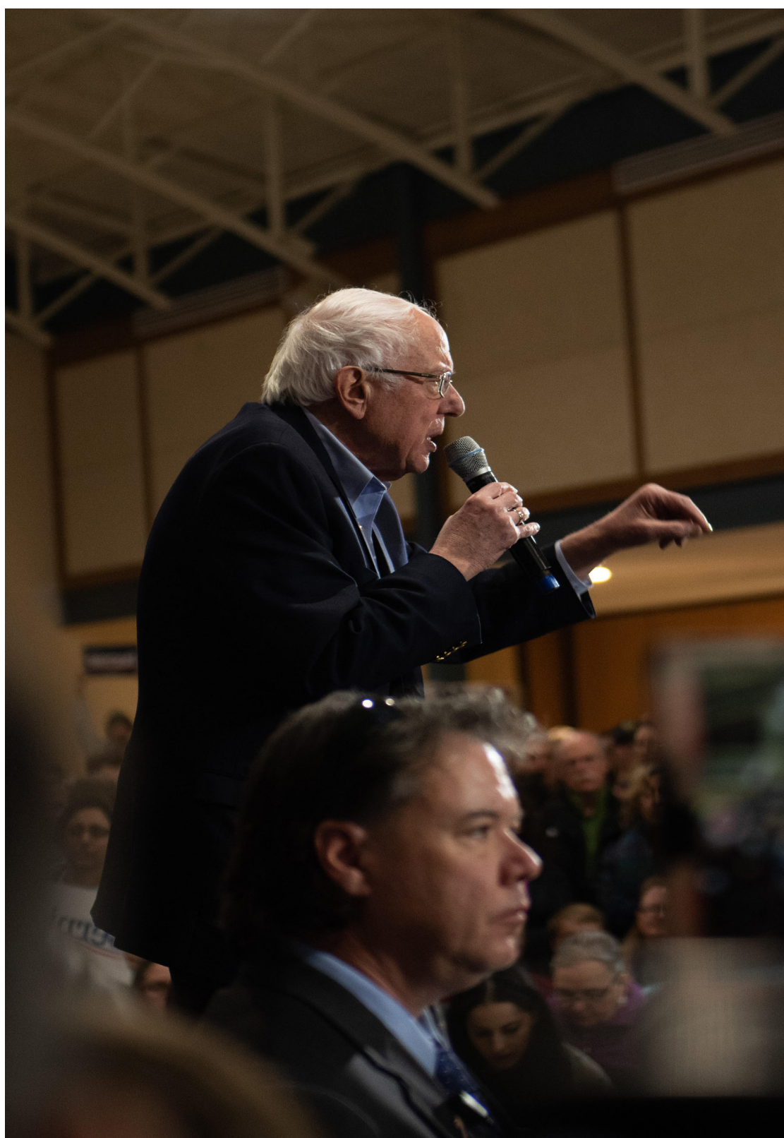
Sanders, the third most donated to candidate by PEA employees. DONATIONS, 2.

“The oldest continuously running preparatory school newspaper in America.”