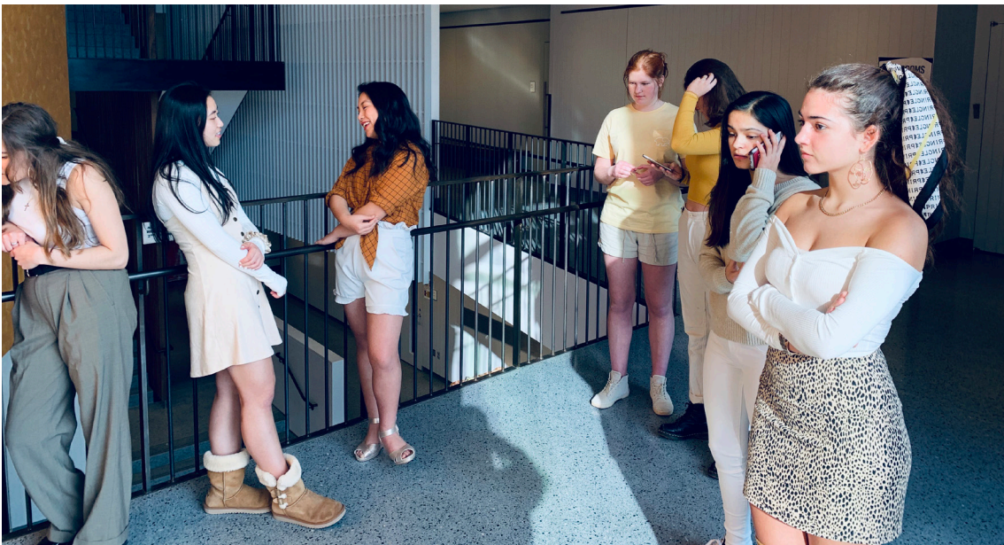
Students assemble for Unity in Color.