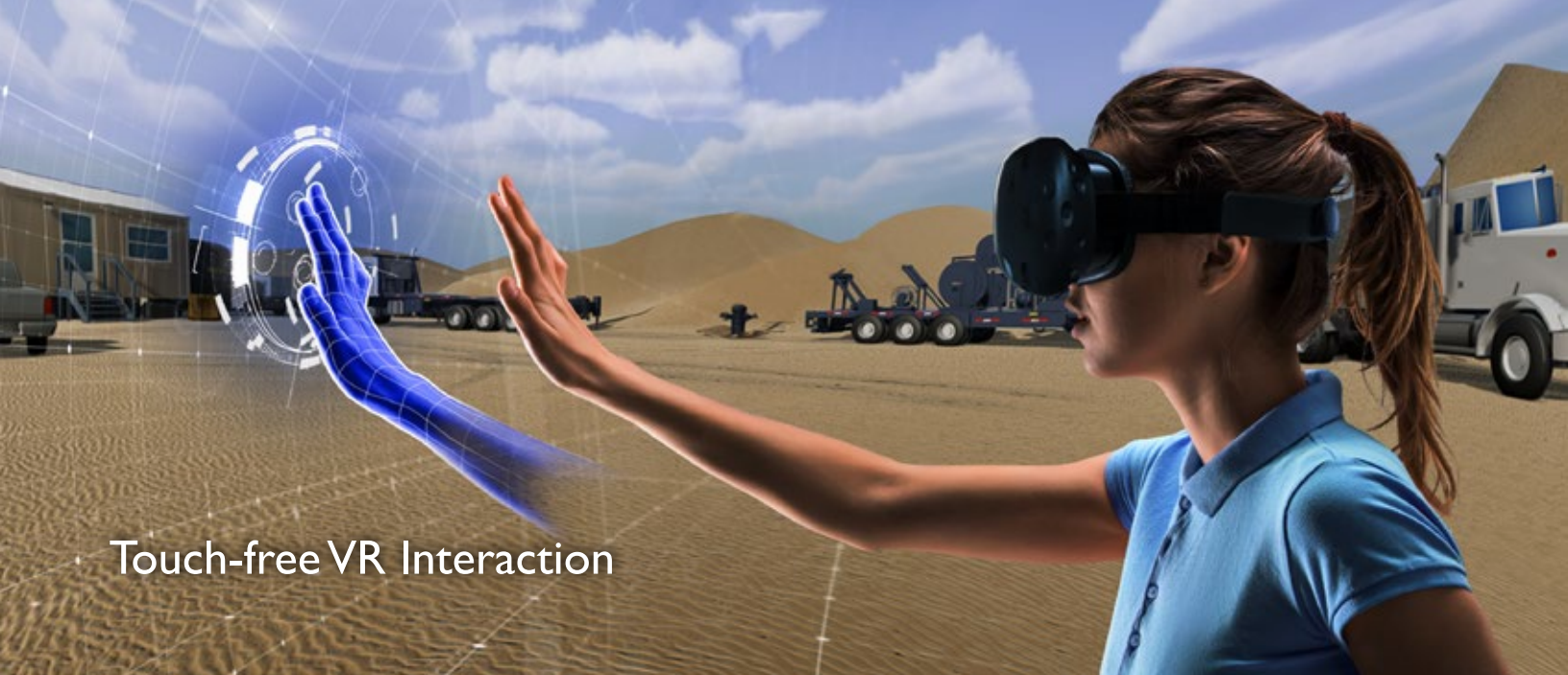
Touch-free VR Interaction