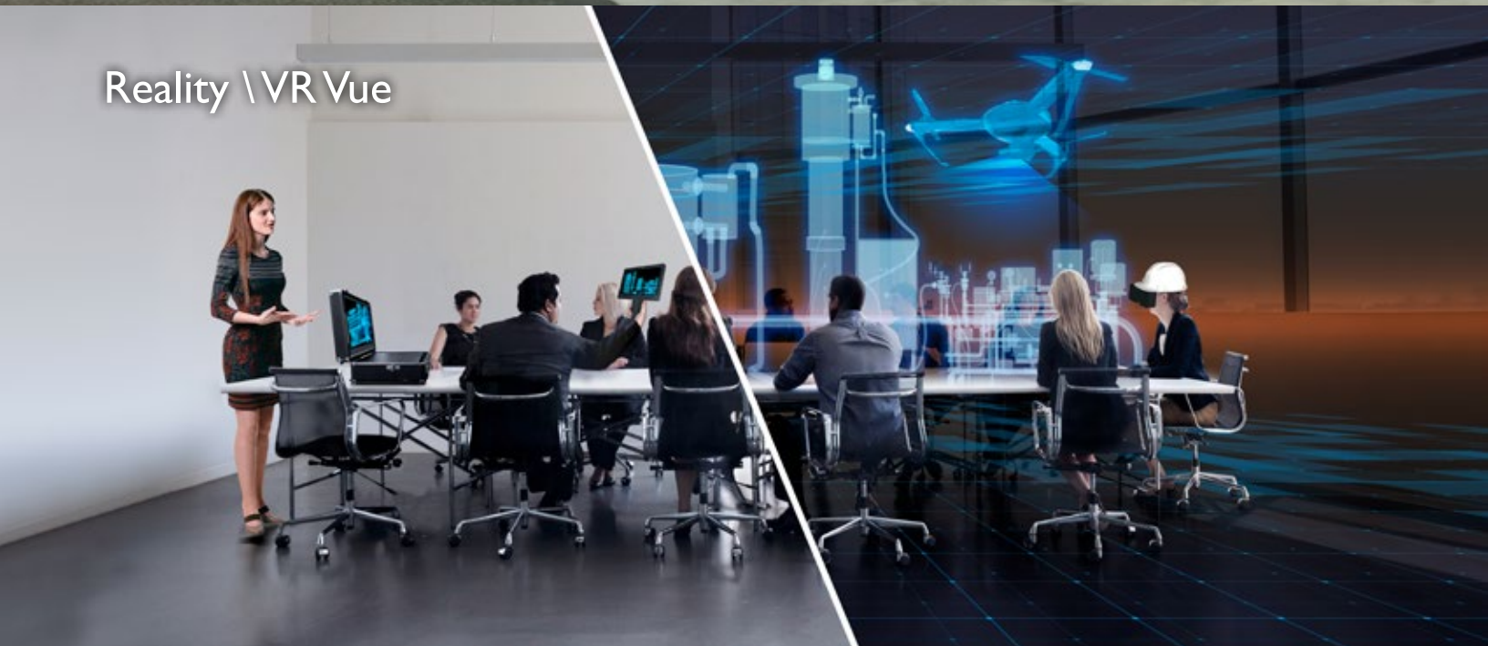
Reality \ VR Vue