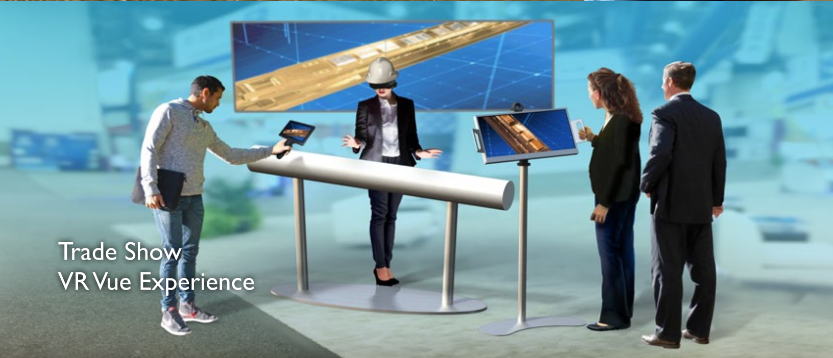
Trade Show VR Vue Experience