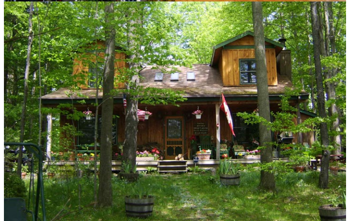
From a new roof, new hardwood floors or a cottage in the woods built from the ground up, these are a few of Tim's past projects