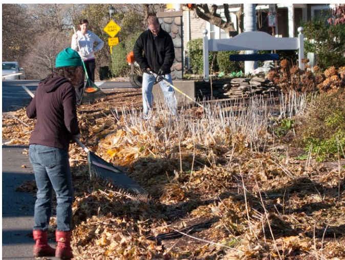
Neighbors gather to prepare the park for winter hibernation