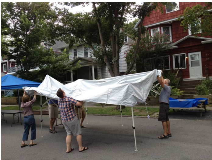
Several neighbors help chip in to set up tents for our annual picnic, held this year on Ericsson street

On August 17th, our neighbors on Ericsson Street warmly welcomed our annual Summer picnic. On a picture-perfect Summer day, over 60 neighbors (and many of their furry friends) gathered for an