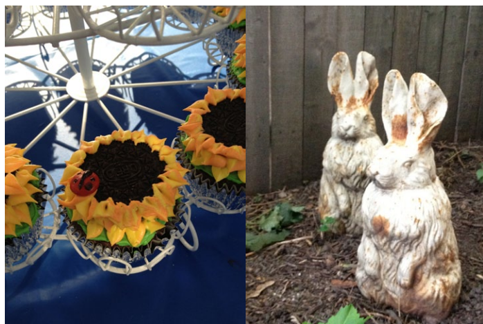
Pictured above - wonderful sunflower cupcakes as one of the wonderful desserts and ornamental rabbits from the garden tour; new this year

veggie and kosher options. As usual, the neighbors pitched in with an assortment of appetizers, side dishes and desserts. Two standout desserts were the sunflower/ladybug cupcakes (Sue Hondorf) and the Canadian Flag themed sheet cake (Allison & Libby), in honor of their move back to Canada – we wish them well. Several new activities entertained both the kids and adults - garden tours, a hula hoop contest and learning some new dance moves courtesy of Esther Brill. This was in addition to a traditional favorite – the balloon toss. Later in the afternoon, our Board President, Susan Glenz, publicly recognized the service of our outgoing board members – Tom Hasman, Maureen (Mo) Duggan, George & Lorrie Lorson, and Matt Alexander – by presenting them with plaques designed by Dave Burnet. Lastly, as a