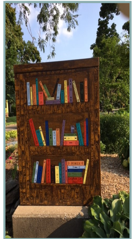
The Traffic Box on Harvard is complete!

Come on Out and Cheer on the Kids! Hope to See Neighbors Out Watching the Parade (or dress up & join us)!