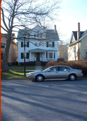
The Henshaw Home on Calumet Street, March, 2006.

If you would like to contact any one of us, please email us at: Rochap21@yahoo.com . We look forward to serving you