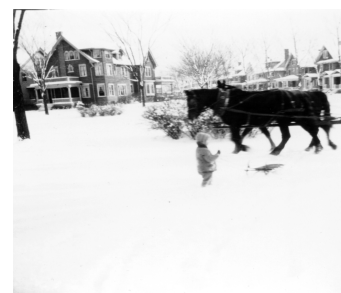
One of the Henshaw girls outside their house, Winter 1920's

day or evening to hear the captain of a canal boat yell, "all up!" to request the Culver Road lift bridge be raised so that vessels could pass beneath it. While the Erie Canal helped Rochester thrive, it also brought it's share of problems. (continued on page 2)