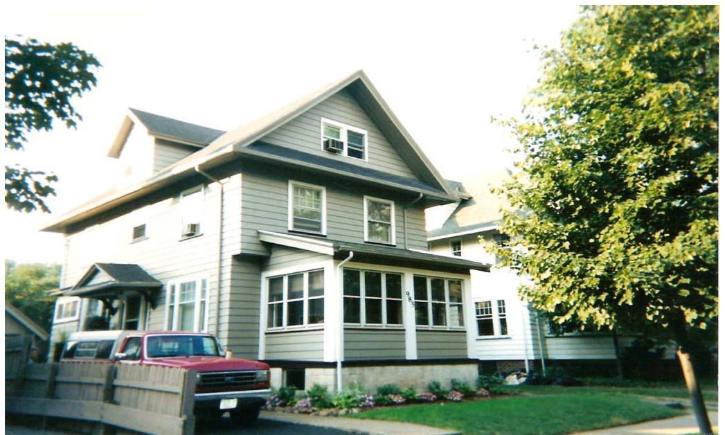
At right, 985 Harvard Street Circa 1999