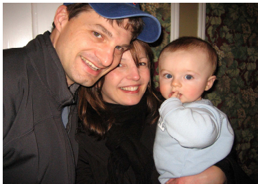
The Baisch-Marshall Family of Harvard Street