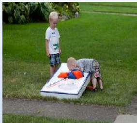
Not sure which version of "pong" they were playing!