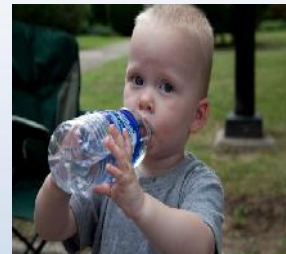
Refreshments for everyone!