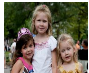
There had better be a prize for this!