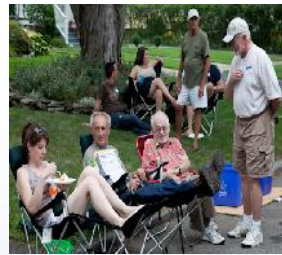
What time is dinner?