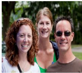
These three had to be separated. . . .