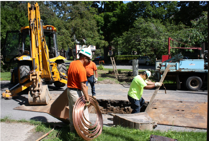
City workers install the new spigot at Morrison Park. It will now be much easier to water the flowers and plants in the park.