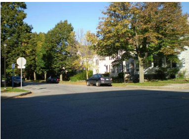
Intersection of Colby Street and Park Avenue, Fall, 2008

Over the course of several years, the Board of CHAP21 has asked that folks be alert to potential criminal activity. While many are diligent in this regard, our neighborhood is never completely safe from crime or intruders as evident in the recent break ins we’ve experienced within the last few weeks. A neighborhood flier was recently distributed with regard to these incidents.