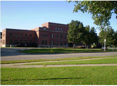
Culver Road Armory, Fall, 2008