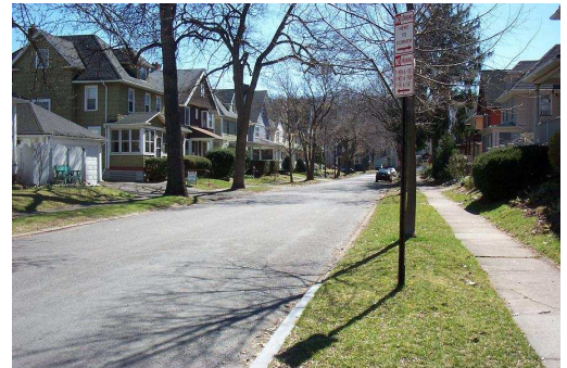
Ericsson Street looking south to Harvard Street, Fall, 2006...

The sub-committee wants to hear from you! We value your input. If you have any suggestions, ideas, issues, or concerns, please share them with us! Email us at Rochap21@yahoo.com