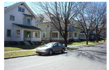
Harvard Street, near the corner of Culver Road, Spring, 2006

CHAP21 Fall General Membership Meeting, October 22nd from 6:30 to 8:00 p.m. Location: TBD