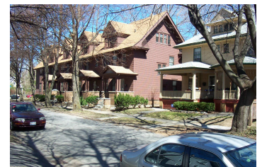
Girard Street looking north towards Park Avenue, Spring, 2006

All dates, events, and locations are subject to change.