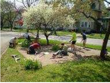
Residents hard at work at Morris Park, April, 2008.