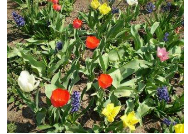
Flower Garden at Morris Park, April, 2008

For a complete list go to: http://www.inforochester.com/marketsfarmer.htm