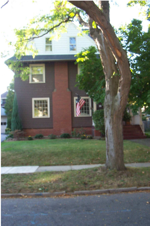
61 Beverly Street, September, 2007