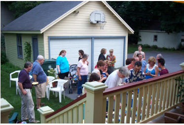
Neighborhood Association Happy Hour, Summer 2006!