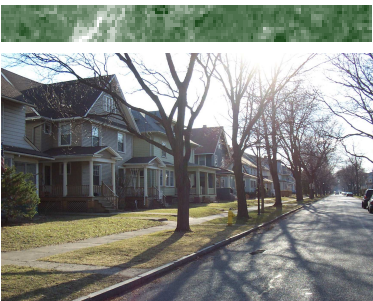
Harvard Street looking west towards Culver Road, Spring, 2005

Over the course of several years, the Board of CHAP21 has asked that folks be alert to potential criminal activity. While many are diligent in this regard, our neighborhood is never completely safe from crime or intruders as evident in the recent break ins we've experienced within the last couple of months.