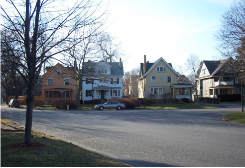
Corner of Calumet and Harvard Streets, site of the proposed Traffic Triangle