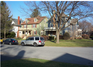
This is now...life at the corner of Calumet/Harvard Streets spring, 2005.

In case you're wondering, the acronym "CHAP 21" stands for: Culver/Colby, Harvard, ABC Street and Park Avenue (reflecting the boundaries of the association). The "21" represents our ward, distinguishing it from our 12 th ward neighbors.