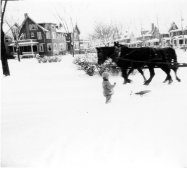
That was then...life at the corner of Calumet/Harvard Streets winter, mid-1920's.