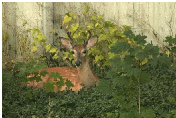
An Update on Harvey—This is the last known picture we have of Harvey (named for the street for which he seems to reside on) our neighborhood deer. He was last spotted about 6 weeks ago, eating apples off the trees at Cobbs Hill Park. If anyone has had any contact with Harvey or has an updated picture to share, please send it to Rochap21@yahoo.com .