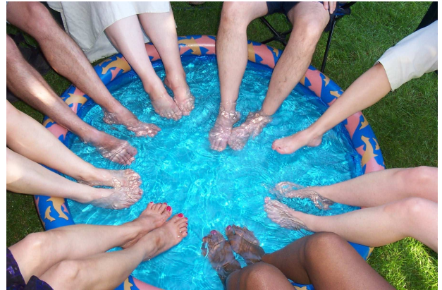
Friends and Neighbors escape the heat during the 5th Annual CHAP21 Neighborhood Association Picnic.