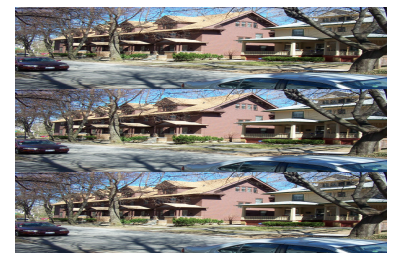
Girard Street looking north towards Park Avenue, Spring, 2006

You can find all installments of the D&C’s Monday Neighborhood Series, “The Street Where They Live,” and accompanying video essays from WHAM-TV Channel 13 at: www.DemocratandChronicle.com .