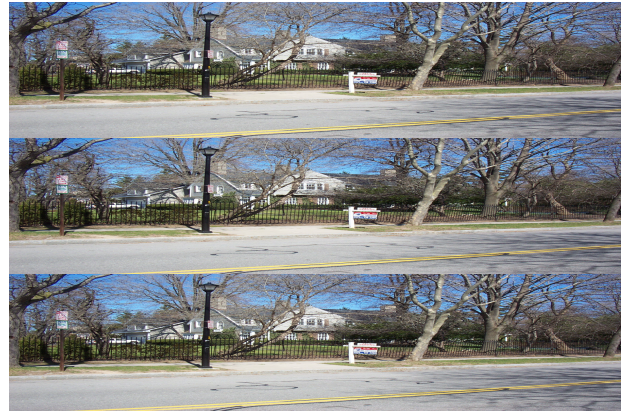
This little gem shown above was for sale, but didn’t sell on the first day

come out of this year’s yard sale were the recruitment of some new CHAP21 Neighborhood Association Members and the unexpected visit from a number of prior neighborhood residents! The bar has definitely been raised on this event. Next year, we’re hoping to increase participation to at least 20 households and there’s even been talk of opening our own “CHAP21 Lemonade Stand!” Remember, its never too early to start cleaning out that cluttered attic!!!