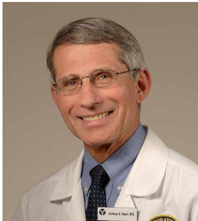
Anthony S. Fauci, M.D. Director, National Institute of Allergy and Infectious Diseases at the National Institutes of Health