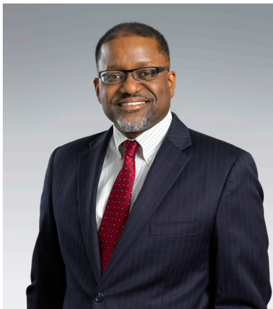
Garry H. Gibbons, M.D.