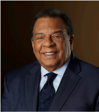
Ambassador Andrew J Young American Politician, Diplomat, Human Rights Activist and President, Andrew J Young Foundation

Andrew J. Young has earned worldwide recognition as a pioneer in and champion of civil and human rights. Ambassador Young's lifelong dedication to service is illustrated by his extensive leadership experience of over sixty-five years, serving as a member of Congress, African American U.S. Ambassador to the United Nations, Mayor of Atlanta, and ordained minister, among other positions. During the 1960s, Young was a key strategist and negotiator during civil rights campaigns that led to the passage of the Civil Rights Act of 1964 and the Voting Rights Act of 1965. Appointed as an Ambassador to the United Nations in 1977, Young negotiated an end to white-minority rule in Namibia and Zimbabwe and brought President Carter's emphasis on human rights to international diplomacy efforts. As two-term Mayor of Atlanta, Young brought in over 1,100 businesses, over 70 billion dollars in foreign direct investments and generated over a million jobs.