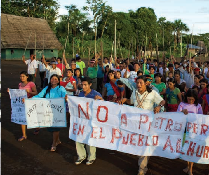
Achuar communities in Peru protest Petroperu's drilling plans in their territory.