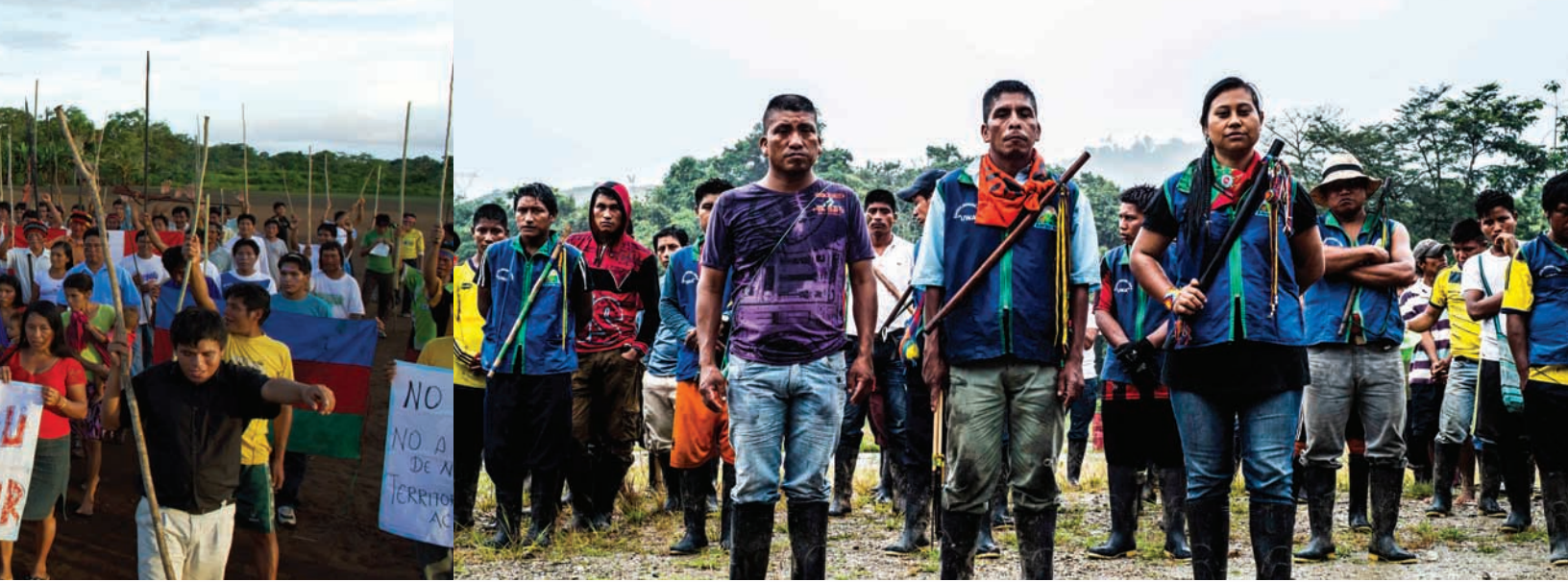
Members of the U'wa during a community roadblock in Colombia.

campaign to keep Talisman out, involving multiple trips to the company's annual shareholder meeting in Calgary, extensive media work, and alliance building with Canadian First Nations. Ultimately Talisman desisted in 2012. Since then the block has been taken over by PetroPeru and Geopark, but little progress has been made due to ongoing Achuar resistance, low oil prices, and opposition within the Peruvian government to the state-run oil company playing a larger role in the oil sector.