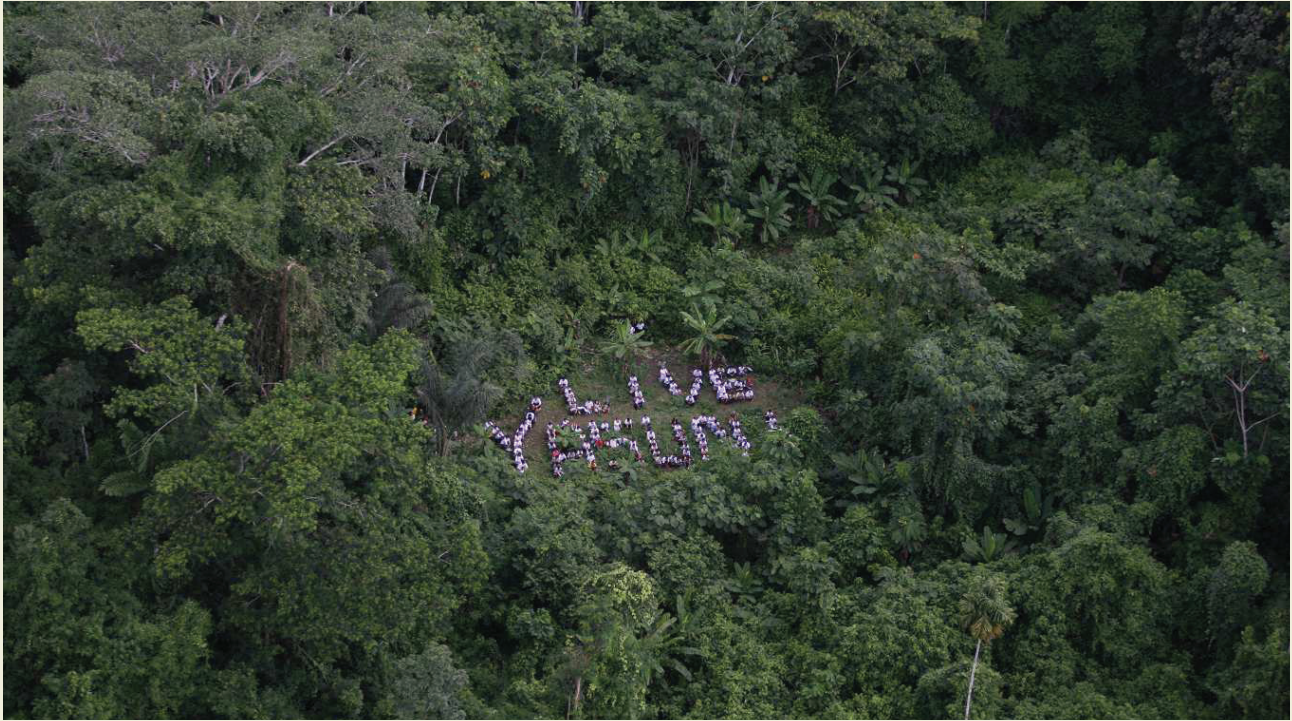
Human banner inside Yasuní National Park to promote the Yasuni-ITT initiative, 2007.