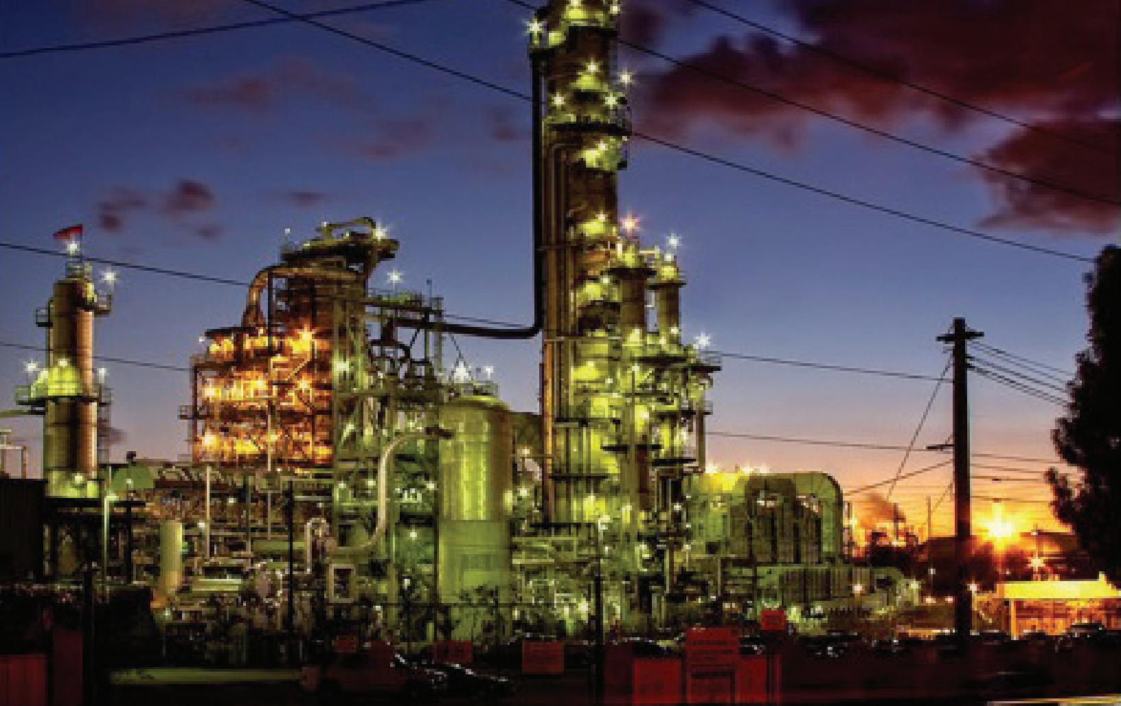
Chevron's El Segundo Refinery, which processes an average of 56,463 barrels of Amazon crude oil every day. While Chevron blames PetroEcuador for its own contamination in the northern Ecuadorian Amazon, its El Segundo refinery is by far the largest non-Ecuadorian refiner of that company's crude.