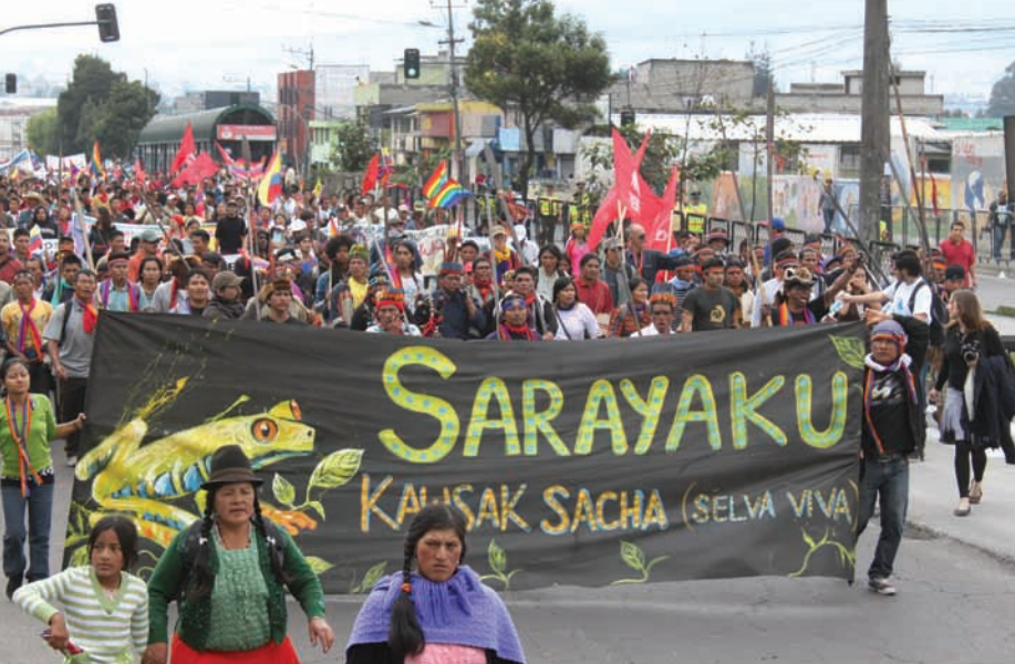
Sarayaku marches during the national mobilization for water rights in Quito, Ecuador, 2010.