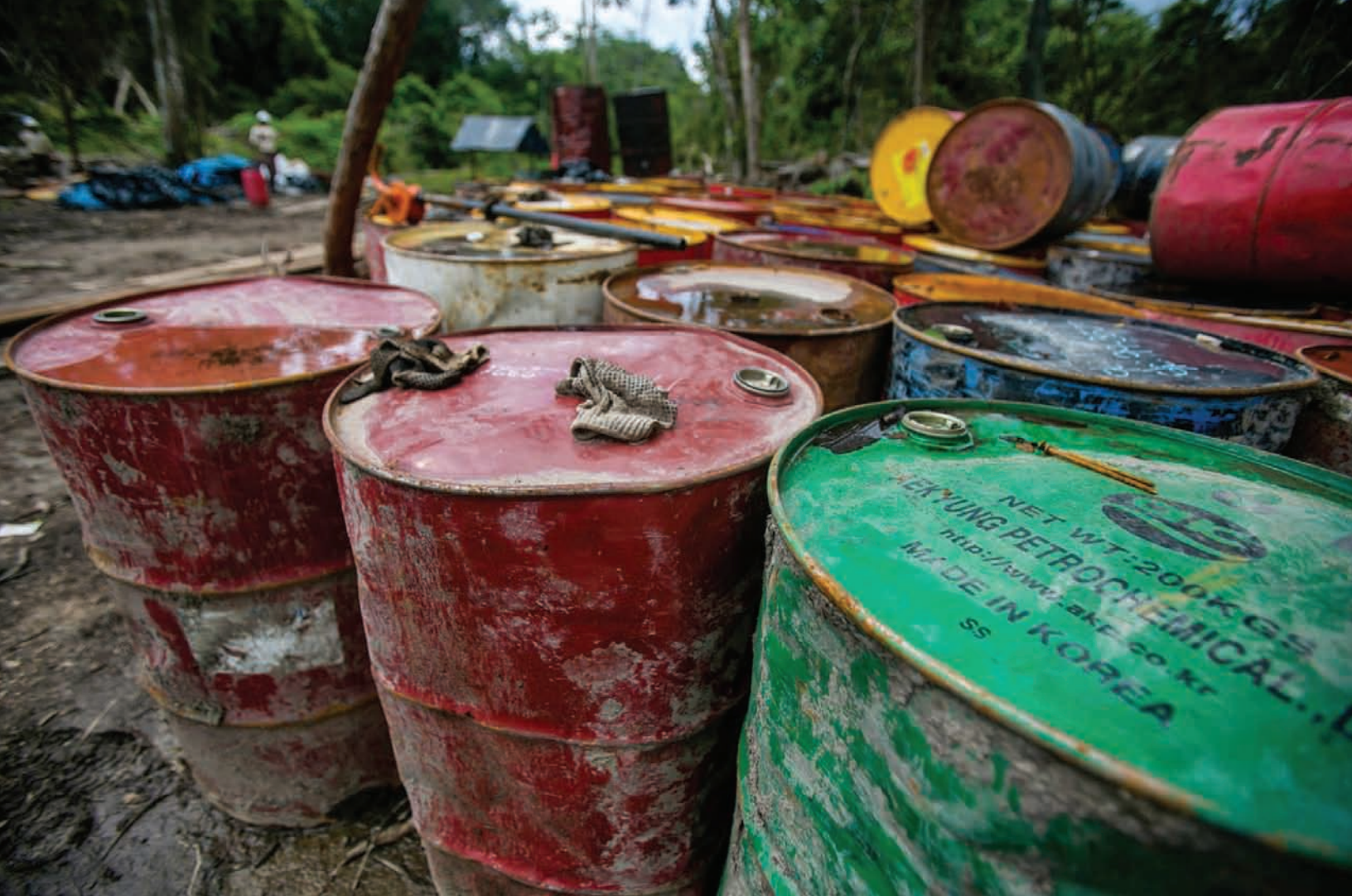
Barrels filled with crude waste after a recent PetroPeru spill.