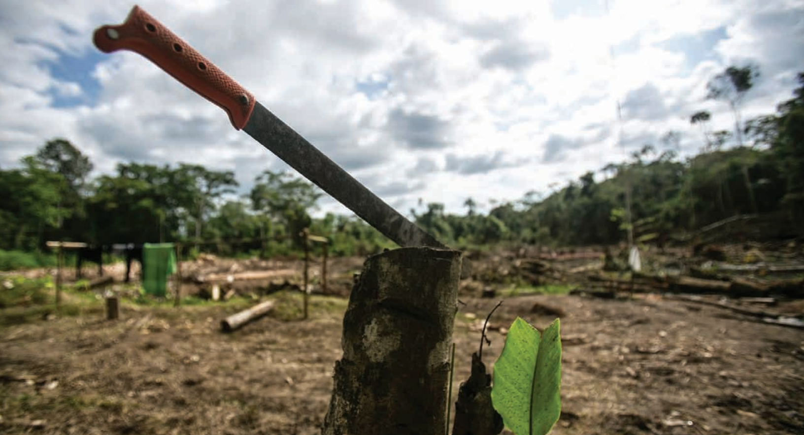
Deforestation from oil spill remediation efforts in the Peruvian Amazon.