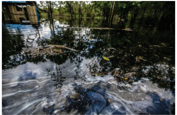
Oil spill in Peru's northern Amazon.

Spills of Amazon crude poisons soil, groundwater, and surface streams causing mouth, stomach and uterine cancer, birth defects, and spontaneous miscarriages, while contaminating fish stocks with major implications on food security. In the northern Peruvian Amazon thirty-five years of oil production – and oil spills resulting from crumbling