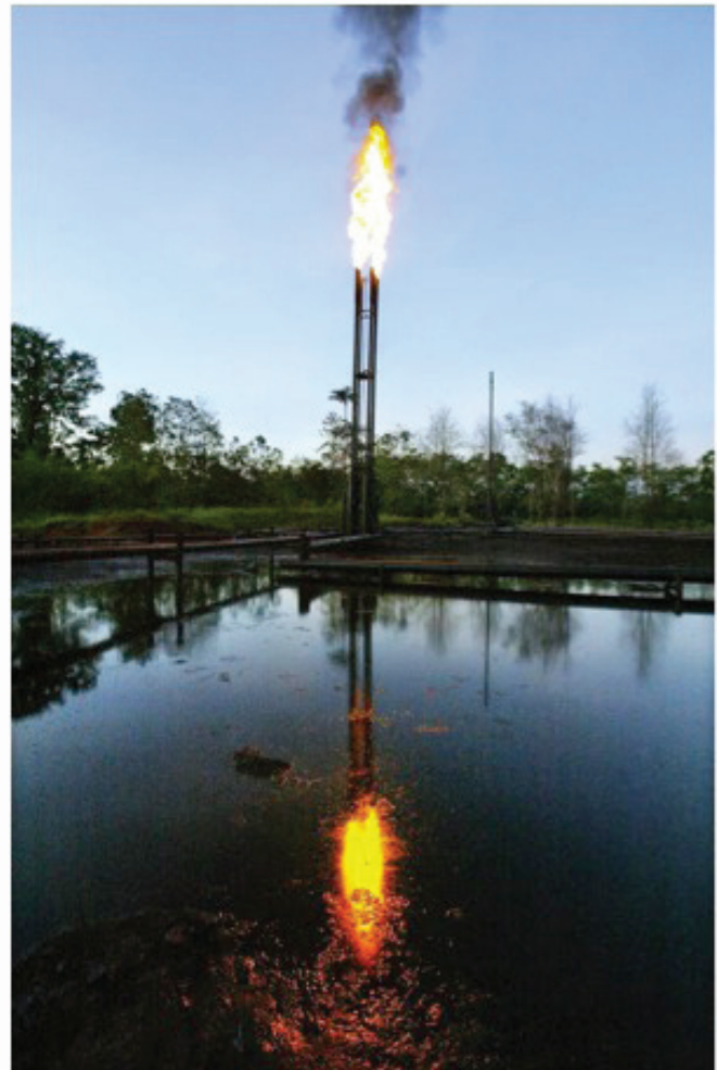
A Petroecuador separation station in Ecuador's northern Amazon rainforest.

In addition, this high-stakes and high-risk business environment has allowed corruption to thrive. China buys nearly all of Ecuador's oil and then resells it to corrupt Ecuadorian oil insiders, who then sell it on the open market at a markup. Private traders then sell the oil to refineries, with most of it going to California. An investigative report based on the Panama Papers showed that two of those middlemen managed to skim $1 off the top of every barrel of oil sold, earning a handsome $70 million "commission." Shell companies and offshore accounts were used to hide the paper trail and the money. These are the same middlemen who received tens of millions in inflated contracts and kickbacks from Petroecuador, a revelation that led to a prison sentence for the company's head and the forced resignation of the country's Hydrocarbons Minister. 24