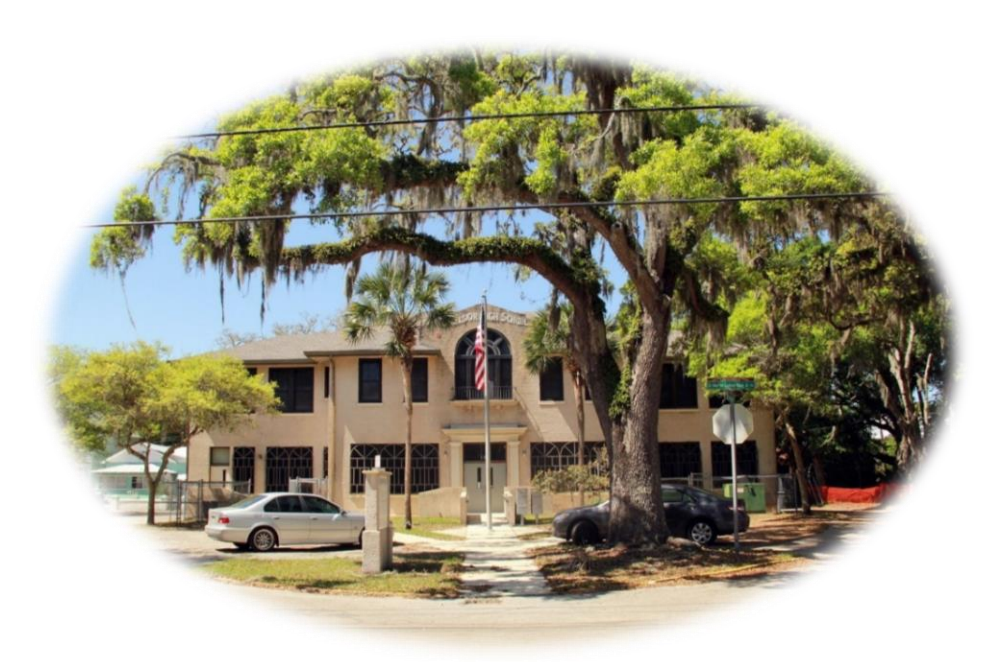
Lincolnville Museum and Cultural Center

Become a part of this story when you support LMCC with the purchase of one or more personalized "Bricks in History": for yourself, your children, family or friends, or in memory of someone deceased.