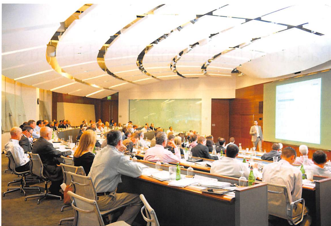
More than 100 advisors came to Dimensional's Austin, Texas, headquarters for two days of seminars.

Advisors selling DFA funds have monthly or quarterly meetings with one another, facilitated by a DFA manager, to discuss portfolio and practice manage-