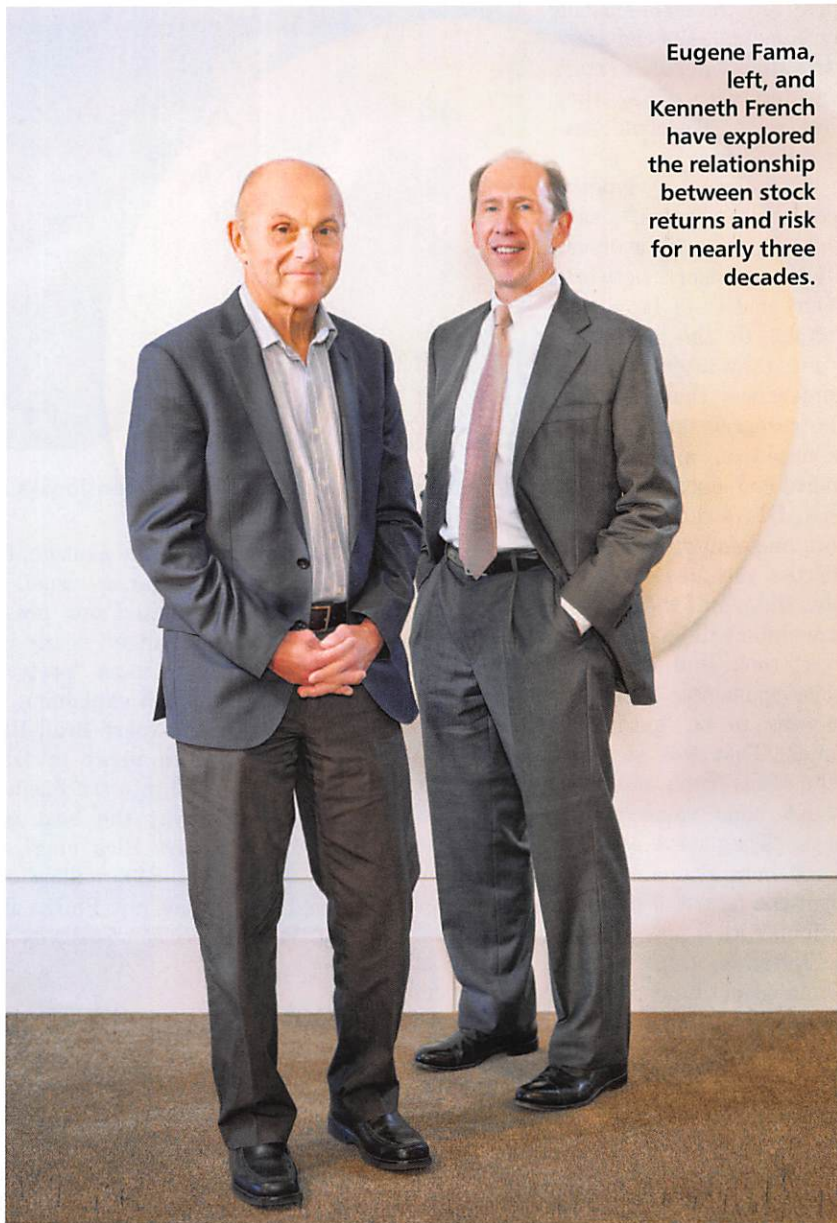
Eugene Fama, left, and Kenneth French have explored the relationship between stock returns and risk for nearly three decades.

The basics of market efficiency are often misunderstood. Some say that if factors such as a stock's value, size, trading momentum, and profitability—all of which are part of your multifactor model—indicate outperformance, then the market isn't really efficient.