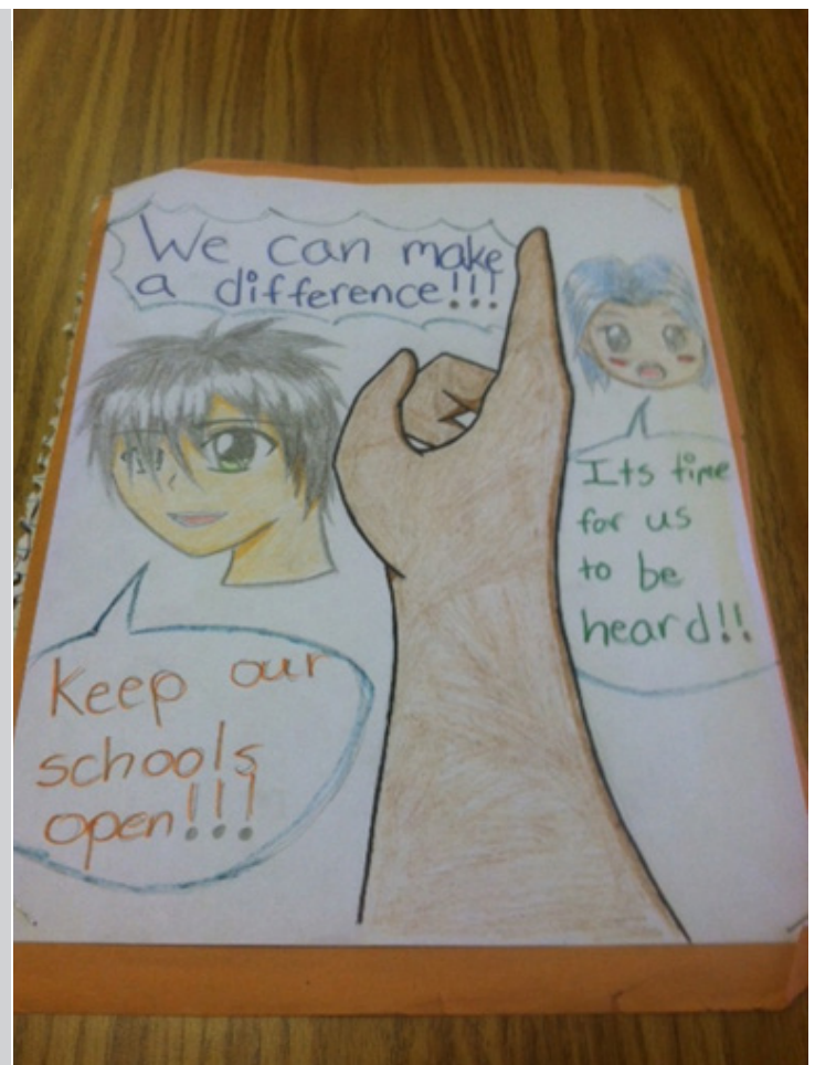
The student's original artwork is pictured above.

It's time for us to be heard, we can come through.