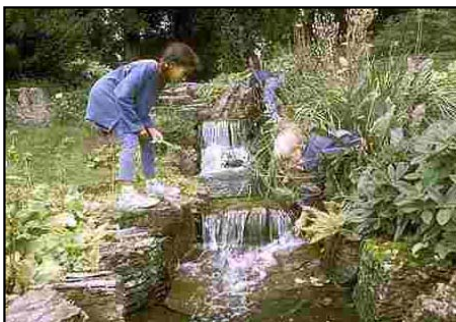
Botanical Gardens, Oslo, Norway

Water is a fundamental aspect of nature in the Northwest, and is one of the elements most likely to engage children’s attention. Sustainable and creative water-play features should be included in nature playscapes, taking water conservation into account and utilizing rainwater and/or on-site sources when possible. Water combined with earthen material like dirt or sand can provide hours of entertainment for a wide range of ages. Small pools, puddles, and muddy areas, running water, and shallow catch-basins are all possibilities for playscape features. If possible, the feature should be designed so that it is usable as a play feature when there is no rainwater available or the water is turned off. The difficulty with water is that it is generally a desirable play feature during the hot