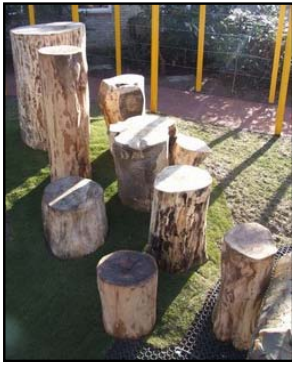
Elm Village Playscape, Camden, UK

There are innumerable uses for well-placed arrangements of wood rounds of various sizes and heights in natural playscapes. Stepping stones, chairs, and climbing and balancing features are only a few of the possibilities for wood rounds at these sites. Again, these are best obtained from within the District, and communication with arborists and other relevant maintenance staff can cut out the need for outside sources, not to mention delivery costs.