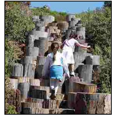
Bay Area Discovery Museum

There are innumerable uses for well-placed arrangements of wood rounds of various sizes and heights in natural playscapes. Stepping stones, chairs, and climbing and balancing features are only a few of the possibilities for wood rounds at these sites. Again, these are best obtained from within the District, and communication with arborists and other relevant maintenance staff can cut out the need for outside sources, not to mention delivery costs.