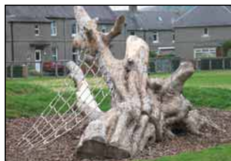
Waverly Park, Isle of Wight, UK

serves such an essential role in natural processes and which kids find fascinating. A similar potential play feature is felled trees or root masses, with the branches and roots retained for climbing. Adding climbing nets or ropes to these creates another level of play potential.