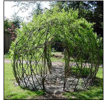
Living willow dome, Quinton Church of England School, Birmingham, England

Plants can also be used to define areas of the site without separating them, to separate the playscape itself from the rest of the park or to screen it from nearby roads or neighborhoods, or to create ‘secret’, isolated areas where kids can play separately from others.