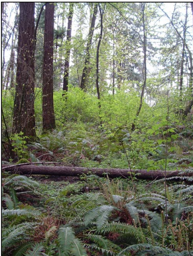
Hyland Forest Park

In order to best meet the goals of nature play in general and free play areas specifically, the following items should be considered in the selection of sites for free play areas in natural areas in the District.