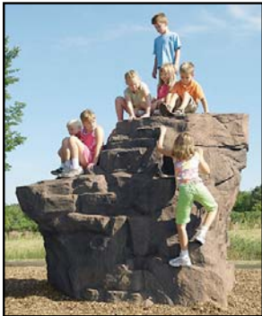
Landscape Structures, Inc. playlsi.com

Stones and boulders can serve many of the same functions as those mentioned above. When boulders are intended to be used as climbing features, they should be hand-picked for textural complexity without sharp edges, to make climbing interesting but not needlessly dangerous. Real, local stone should be used when possible, but another option is fabricated climbing structures similar to that pictured here, which is made from glass fiber reinforced concrete. The benefit of such structure is its durability, size, and accessibility, and it may be appropriate for some sites, especially in combination with real stones or boulders.