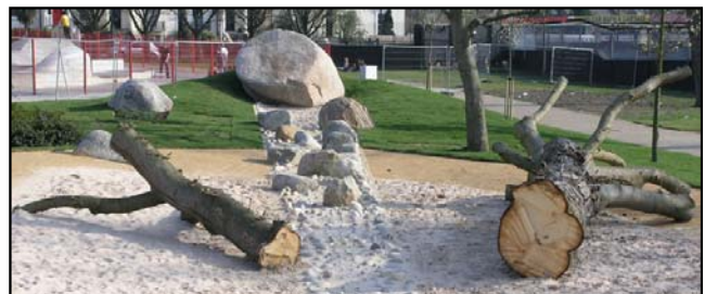
Canteloves Gardens and Skatepark, Camden, UK

Downed trees are a common feature in forest settings, so their presence in a playscape enhances the natural appeal of the area. Logs of various sizes, species, and states should be included throughout the site. Different states of logs may include those hollowed out to create a natural tunnel or left whole, those stripped of all bark or in their original condition, with bark, moss, ferns, and other natural attributes left intact. In all cases using trees felled in other District parks is a sustainable approach and, in the latter case, increases the potential presence of insects, fungi, and other small-scale wildlife that