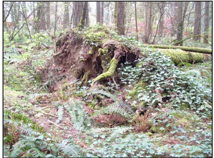
Hyland Forest Park

In addition to a diversity of live vegetation, there should be variations in the terrain of the area. This could involve downed trees and branches of various sizes, slope changes (though this should be limited to a certain grade to account for erosion concerns), depressions caused by root upheaval, or other naturally occurring phenomena that allow for climbing, hiding, balancing, or other playful physical challenges. In areas deemed otherwise appropriate for play areas but without much variation in terrain, additional logs, boulders, or other large natural debris from other areas or parks can be installed at the site.