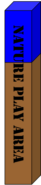
Figure 2: Boundary Marker

Standard posted park rules will apply to free play areas. Additional rules not typically posted but listed in the District Rules and Regulation handbook will not necessarily apply to these areas, including off-trail play activities such as building forts, climbing trees, wading in streams, and digging in soil. However, certain activities will remain prohibited, including paintball guns, destruction of vegetation, and excavation of soil deeper than 18 inches 5 . As a new and unprecedented park amenity, this project obviously falls into a regulatory gray area. Because of this, it is important to clearly communicate the District’s expectations to patrons, via signage and staff presence, and to observe how the site is being used and modify the rules and/or signage as necessary.