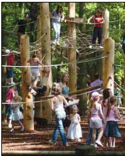
Coombe Abbey Country Park, UK

These structures are most similar to typical modern playground structures in their intent, but may differ in their materials and their appearance. There are unlimited options for such structures, but they should, in general, creatively follow these guidelines.