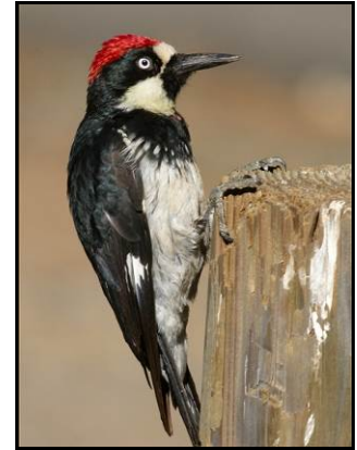
Acorn woodpecker

The presence of beaver in an area also poses a safety concern for siting nature play areas, due to the nature of beaver chew on vegetation, which creates a sharp wedge or point on the remaining stump. Though the presence of beaver should not be a precluding factor in an otherwise appropriate site, this is an issue that should be considered and accounted for in site selection and safety inspections.