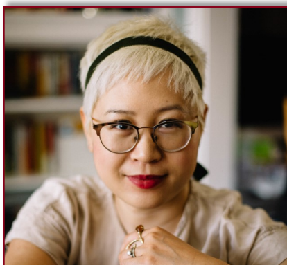
Esmé Weijun Wang

Award-Winning Author of The Collected Schizophrenias ADVOCATES AWARD