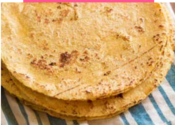
HOMEMADE CORN TORTILLAS