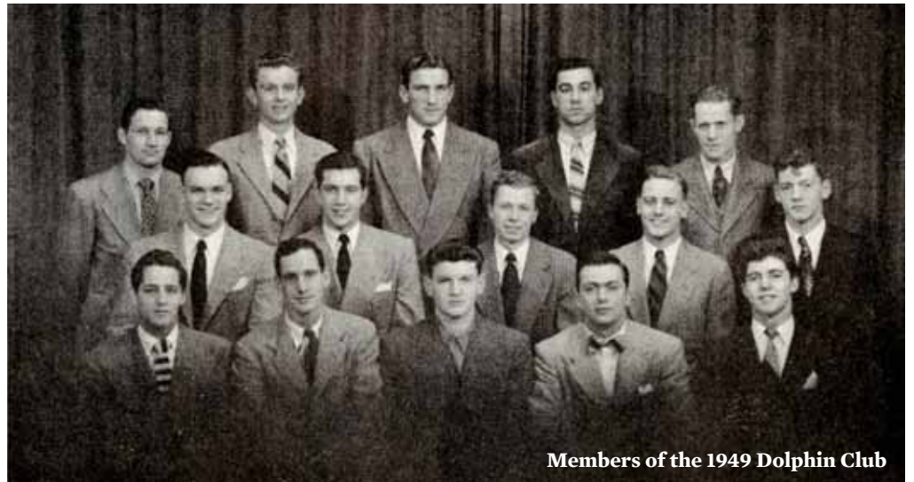
Members of the 1949 Dolphin Club