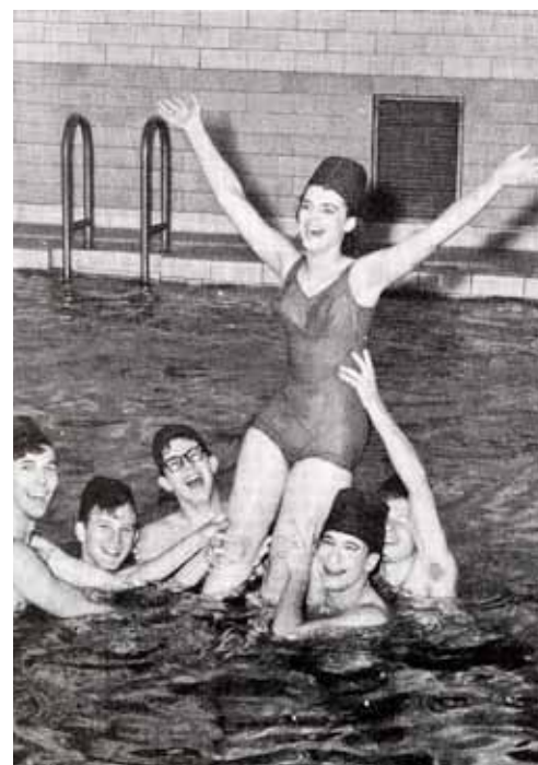
TOP The "land cast" in rehearsal for South Pacific (1969) MIDDLE The synchronized "Carousel Ballet" from Carousel (1968) BOTTOM LEFT Cast members strike a pose in The Mikado (1964) BOTTOM RIGHT The aquatic "Shriner's Ballet" in Bye Bye Birdie (1968)