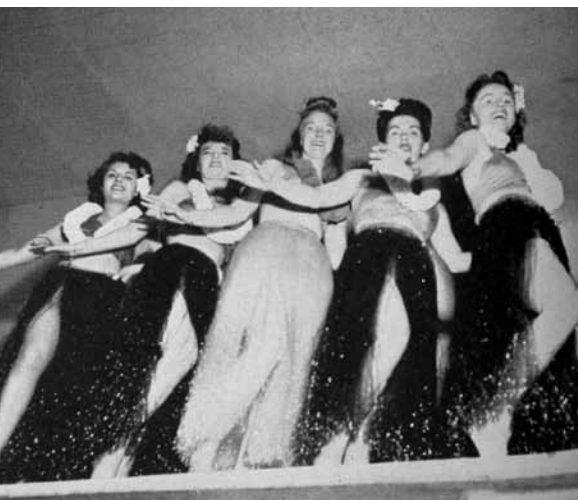
Poolside hula dancers in Wela Kahau (1944)