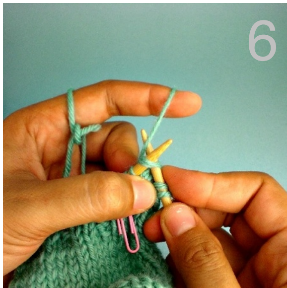
Getting ready to knit the loop together with first stitch on left hand needle