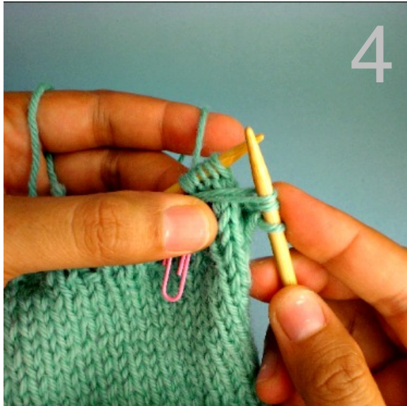
Pulling up a loop