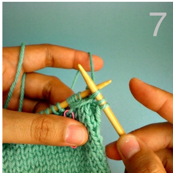
Knit the loop together with the first stitch on the left hand needle