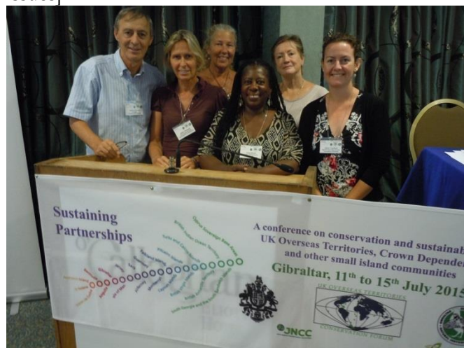
Bermuda representatives