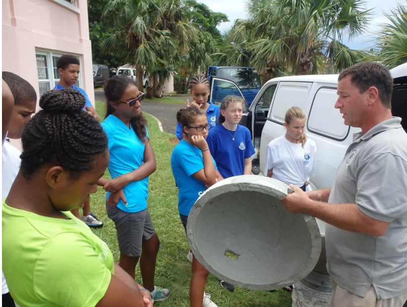
Conservationist campers learning about Longtail igloos

The BZS held a residential camp, called Conservationist Camp , on Trunk Island from August 17 th to 21 st for M3 to S1 students. This was the first residential camp on the newly acquired 'Living classroom'. Students volunteered their time in the mornings at BAMZ then learned about topics such as lionfish, sea turtles, toads, longtails, marine habitats and fish from local experts and BZS staff. [C2.7camp, C3.10 field trip, C3.11 school group/BZS].