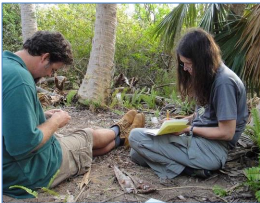
Land snail survey