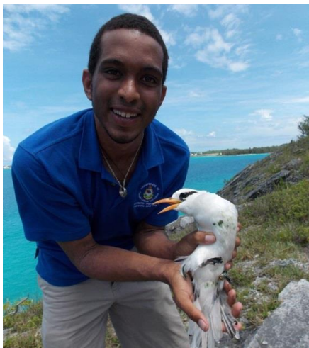
Re-capturing a Longtail with a tracking tag