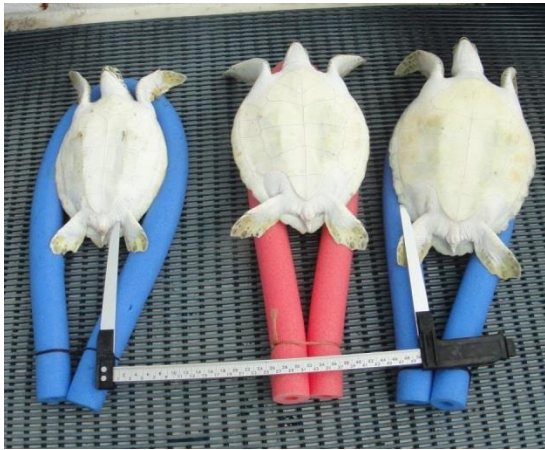
Turtles awaiting tagging

http://bernews.com/2015/09/bermuda-turtle-project-successful-season/