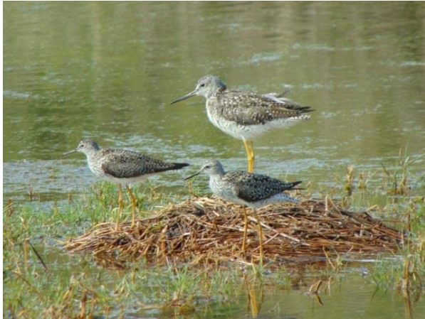
Great and Lesser Yellowlegs at Spittal Pond

In celebration of World Shorebirds Day , the Bermuda Audubon Society held a field trip to Spittal Pond on September 6 th to look for migrant shorebirds. A sighting of a Baird's sandpiper was the highlight of the day. [E8.2 international day event, K3.5 community spp data, E3 comm data, C3.10 field trip].