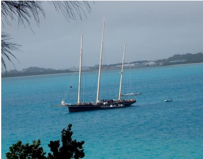
Spirit of Bermuda at Nonsuch in January

Since 2006, more than 3,000 young islanders have participated in the expeditionary learning program provided by Bermuda's tall ship, Spirit of Bermuda . The annual middle school program fosters intellectual and character growth through structured science, math, engineering and technology-based shipboard lessons, and also supports the Bermuda Public Schools curriculum. - See more at: http://www.bios.edu/currents/bios-bermuda-sloop-foundation-partnership/#sthash.Iy2YL7PP.dpuf [C3.10 outdoor learning, C2 educators, C3.11 bio station].