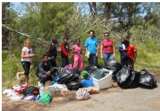
Clearwater Students at Officers Beach

On September 19 th , Keep Bermuda Beautiful (KBB) hosted the annual coastal clean-up sponsored by EY Bermuda. [E1.5 cleanup].