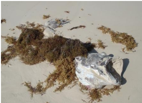
Dead Grouper, Cooper's Island

A fish kill was reported at the beginning of the month, affecting large fish such as Black Grouper. A number of fish were found floating, either dead or dying, around the island. [B4.10 gov personnel, B4.12 emergency response, J5, ?E3.6]. http://bernews.com/2015/10/fish-kill-investigation/