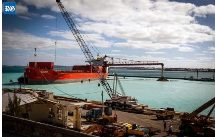
Balder at Dockyard. Photo by David Skinner, from the Royal Gazette.

http://www.royalgazette.com/article/20151117/NEWS25/151119751