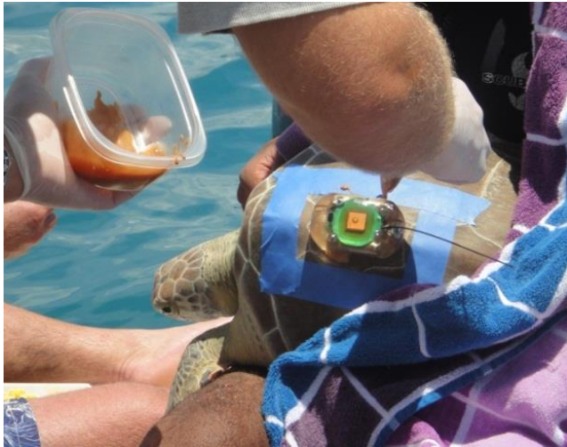
Satellite tagging a Dockyard turtle

The Marine Conservation Section of the Department of Conservation Services visited the South Basin in Dockyard on June 19 th to capture and satellite tag the resident green turtles . [informed mgt K1.3, K1.5, K6.3, K6.4].