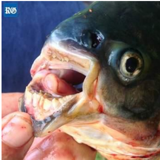
Jaws of a Pacu from Somerset. (Photo by Conservation Services in the Royal Gazette).

http://www.royalgazette.com/article/20151110/NEWS/151119971