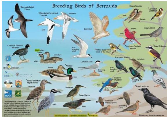
Breeding Birds card

http://www.royalgazette.com/article/20151217/NEWS07/151219741 http://www.audubon.bm/2-about-us/178-bermuda-bird-id-cards-for-sale