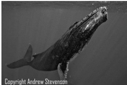
The winning photo

Photographer Andrew Stevenson was awarded “Highly Commended – Most Publically Liked Entry” for his photo of a humpback whale off Bermuda at the Prince of Wales’ Commonwealth Environmental Photography Awards ‘Out of the Blue’ competition. [E5.2 art].