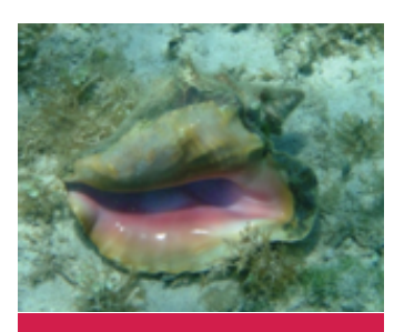
Queen Conch

By removing shells from the beach, you could be killing an animal or depriving a creature of its current or future home. You may also be breaking the law. Please don't do it.