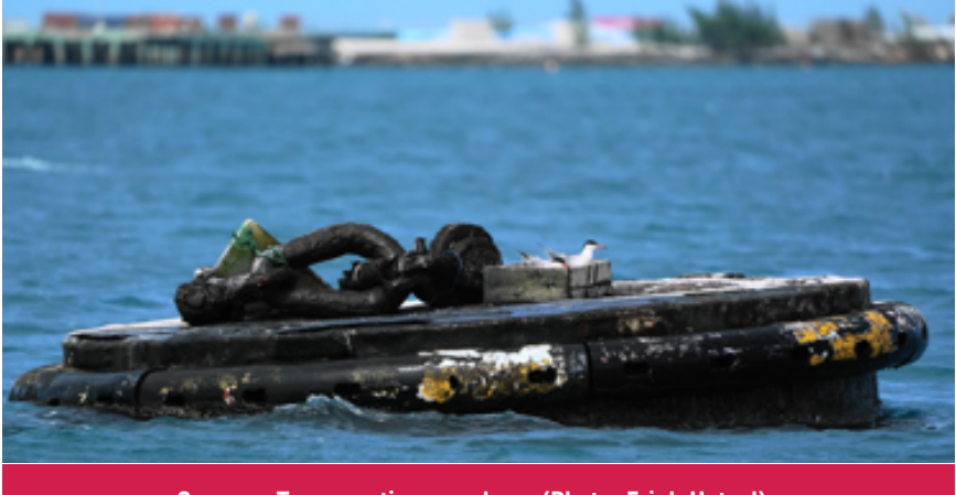
Common Terns nesting on a buoy

Although the Common Terns were off to an encouraging start this year, our hopes were soon dashed when the terns abandoned four eggs in Hinson's Bay and then we lost a pair of chicks from a buoy in the Little Sound. Fortunately, the experienced St. George's pair raised two chicks to fledging. Also, the Hinson's Bay pair persevered and they eventually raised two chicks to fledging. Unfortunately, those four fledges represented our total Common Tern productivity for the season.