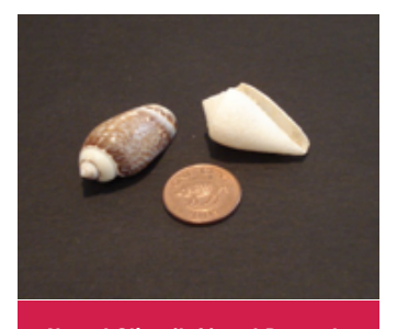
Netted Olive (left) and Bermuda Cone Shell (right), both shells are listed as protected species under the Fisheries (Protected Species) Order 1978.