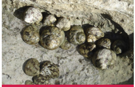
West Indian Topshells – a protected species