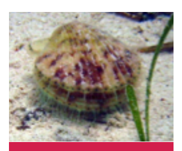
Calico Scallop, protected by both the Fisheries (Protected Species) Order 1978 and Protected Species Amendment Order 2016

If your chosen souvenir is a Queen Conch, the penalties above apply, but these shells are also protected by an international treaty – the Convention on the International Trade in Endangered Species or CITES, which regulates the movement of listed plants and animals. This means that even if you do successfully carry a Queen Conch off the island, you could run into fines or jail time in your home country, or any airport you transit through. Violations of this treaty are taken very seriously by authorities worldwide.