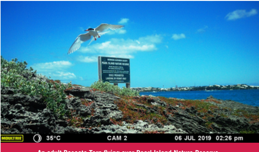
An adult Roseate Tern flying over Pearl Island Nature Reserve

It was a drama-filled summer for Bermuda's two breeding tern species. In April, with the help of Tim Patton's barge and many volunteers, we installed a sound system on Pearl Island and tern decoys on both Pearl and Lambda Islands. The solar powered sound system played a continuous loop of Common and Roseate Tern calls during daylight hours. This attractant system has been used in many other jurisdictions with great success. Our hope was that we could attract the terns away from the old Navy buoys in the Little Sound, which are perilous places for terns to be raised – even if they are rat and cat free. Pearl Island, where last year we had a pair of Roseate Terns nest for the first time since 1849, is an ideal nesting habitat for terns. It has been over ten years since Common Terns have nested on Pearl Island though. We did not know if the attractants would work in Bermuda, since our Common Terns are not colonial nesters, preferring to disperse amongst the islands.