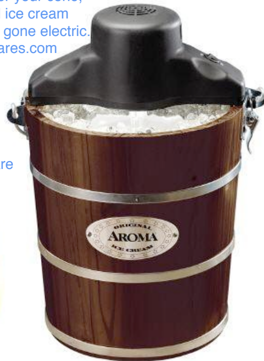
Aroma Ice cream season is now approaching. Homemade is still popular when it comes to peach flavor or pistachio. No need to crank for your cone, the wood barrel ice cream maker has now gone electric. aroma-housewares.com