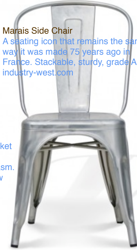
Marais Side Chair A seating icon that remains the same way it was made 75 years ago in France. Stackable, sturdy, grade A steel. industry-west.com