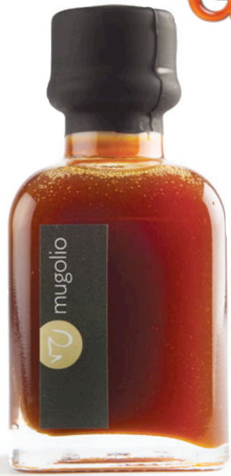
Muglio Syrup from pine cones. Italian Dolomite forest pine cones. Decadence, meant to drizzle over yogurt, gelato or panna cotta. Delish. deandeluca.com