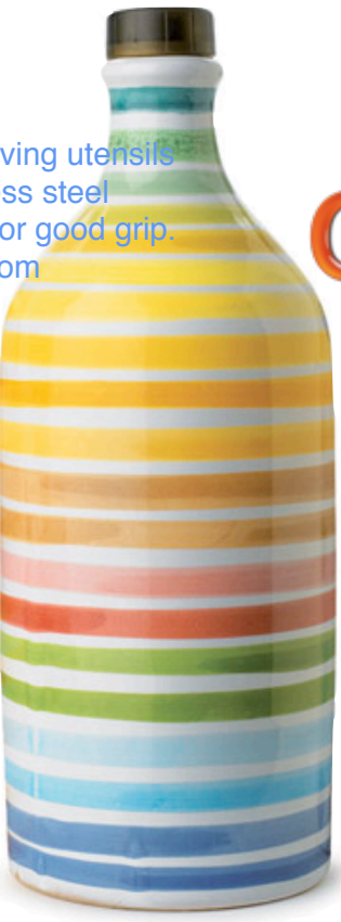
Olive Oil "You had me at that bottle". But, let's mention the contents inside this beautiful Puglian pottery jardinare is the finest extra virgin olive oil from Antico Frantoio Muraglia. deandeluca.com