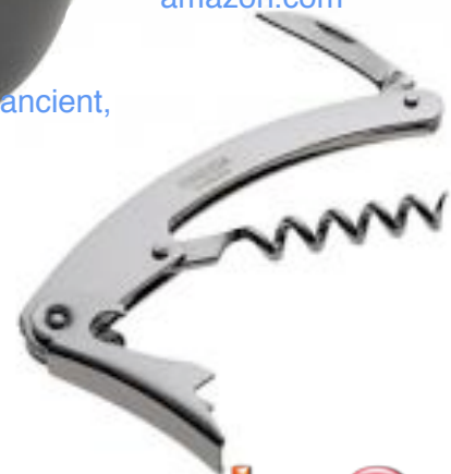
Time For Wine Get uncorked in under a minute. This is the tried-n-true classic cork screw, before the term mixology was used. By Oneida. amazon.com