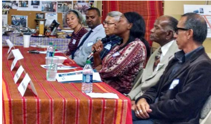
Figure 7. Seattle’s Community Cornerstones project was initiated in response to accelerated development pressures along a new light rail that runs through lower-income communities in Southeast Seattle. (Graphic: H. Hall)

Yet in places like Southeast Seattle, where no ethnic or racial group comprises a majority and over 90 languages are spoken, areas around light rail stations are undergoing the early stages of gentrification. In 2011 the City of Seattle won a HUD Grant to prevent “residential, cultural and commercial displacement” and used the funds to create the Community Cornerstones program to prevent displacement as light rail stations are built and significant private development occurs. 25