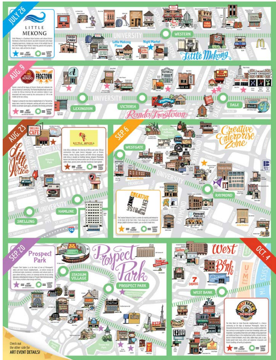
Figure 3. C4wards along the Green Line (Graphic: LISC Twin Cities)