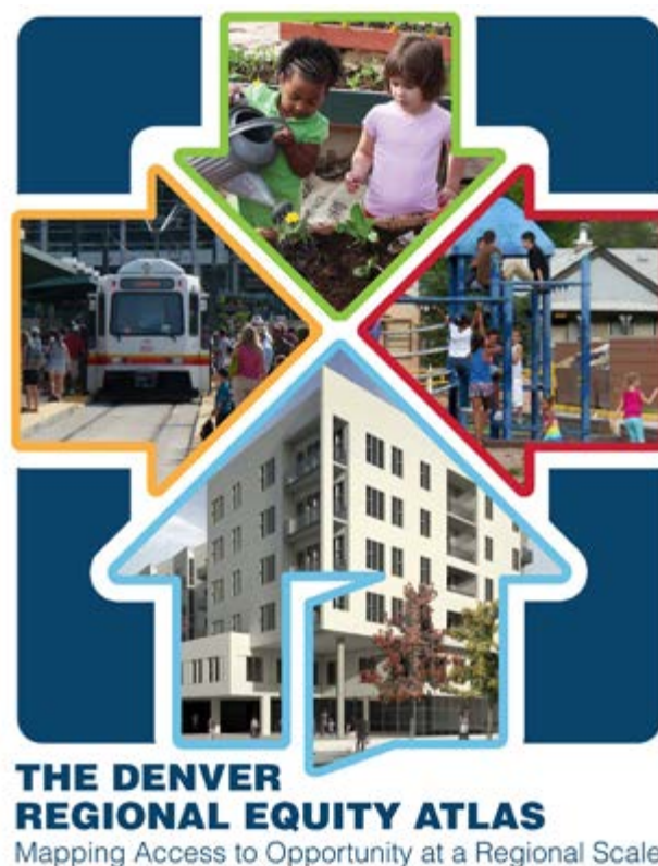
Figure 9. Among MHC's research and data efforts was the creation in 2012 of the Denver Regional Equity Atlas to visualize and quantify regional disparities.

Mile High Connects (MHC) is a coalition of more than 70 private, public and non-profit organizations in the Denver metro area working to “increase access to housing choices, good jobs, quality schools and essential services via public transit.” 29 The Coalition includes national partners such as the Ford Foundation, Enterprise Community Partners, Chase Bank and Wells Fargo, and many local non-profit, private-sector and philanthropic partners. 30 The catalytic moment that created MHC was the passage in 2004 of FasTracks, a $7.8 billion transit expansion that included 122 miles of new rail, 18 miles of bus rapid transit, and enhanced regional bus service to the regional transit district. Development response to this level of public investment in a regional transit vision was tremendous and introduced a renaissance of urban housing. However, it is also creating displacement pressures in low-income communities and communities of color.