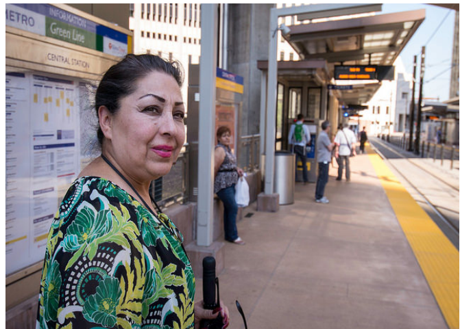
Figure 2. Waiting for the Green Line in Saint Paul, MN

The 11-mile Green Line light rail opened in June 2014, linking aging, racially-diverse neighborhoods that had experienced “decades of disinvestment” with the downtowns of Saint Paul and Minneapolis and other employment hubs, including the University of Minnesota and the state capitol. The line has exceeded ridership projections with an average weekday ridership of 30,000. In just five years, more than $4.2 billion has been invested in residential and commercial development (not including the new sports stadiums) along the Green Line. 4