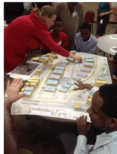
Figure 1. Community engagement and coalition building for eTOD

Equitable outcomes require smart, intentional strategies to ensure wide community engagement. Successful eTOD requires planning not just for transit, but also for how this type of catalytic investment can help to advance larger community needs including affordable housing, workforce and small business development, community health and environmental clean-up.