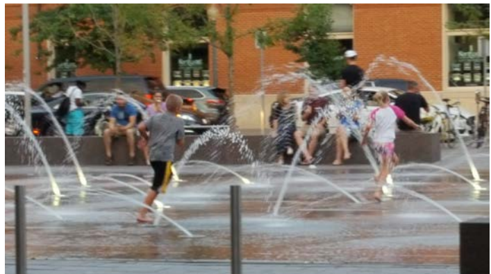
Figure 8. Active and inviting public spaces, like this one outside Denver's Union Station, are part of successful eTOD.

Denver was selected as a case study to demonstrate the critical role that cross-sector collaboratives can play in advancing real change not only in the policy arena, but also in shaping the public narrative around transit and affordable housing. Their collaborative approach has also generated substantial investment of private capital to support equitable TOD which has become a national model for other regions seeking to bridge the funding gap often inherent in affordable TOD projects.