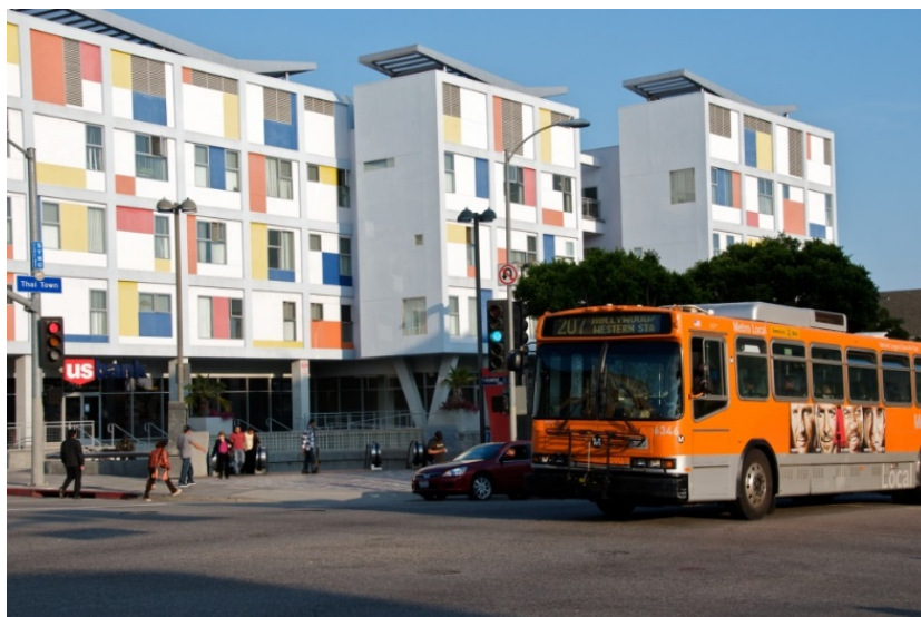
Figure 4. Transit, walking and biking included Metro's eTOD projects.

Economic and racial inequity have become galvanizing forces for action in the greater Los Angeles region. According to a Brookings Institution ranking of metropolitan inequality, the Los Angeles metropolitan region ranks seventh. 13