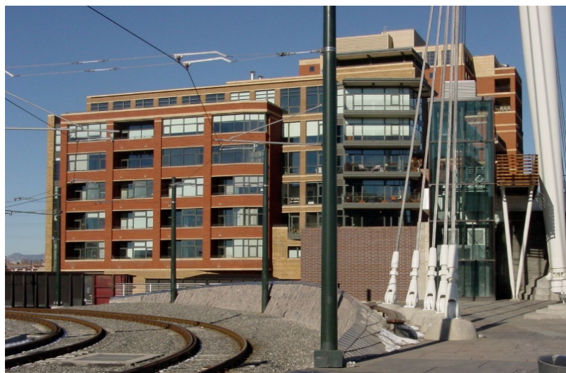
Figure 11. Transit agencies can pursue TOD through FTA's Joint Development