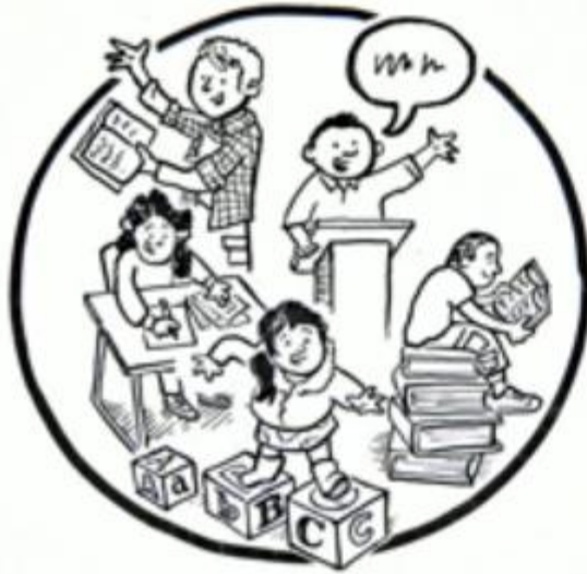
ENGLISH LANGUAGE ARTS