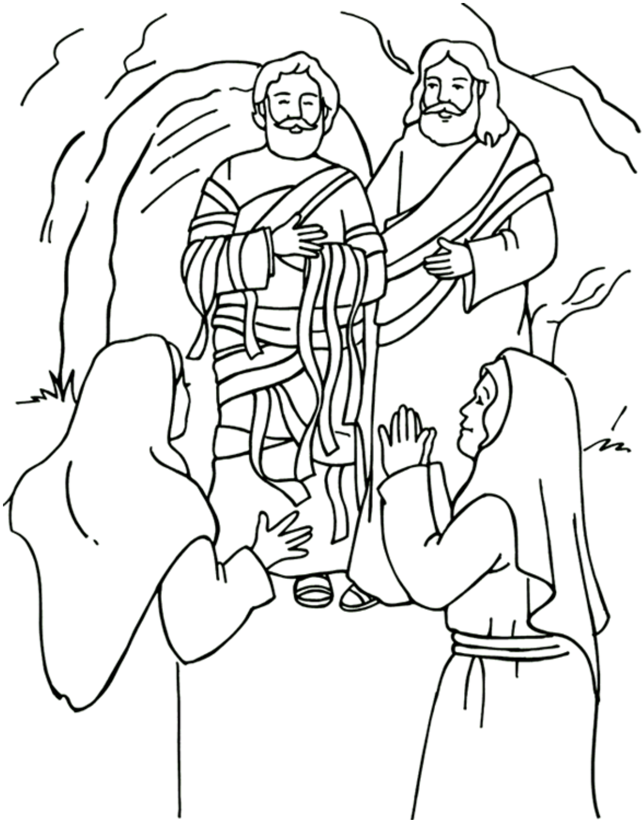
Jesus raises Lazarus. Luke 10 John 11