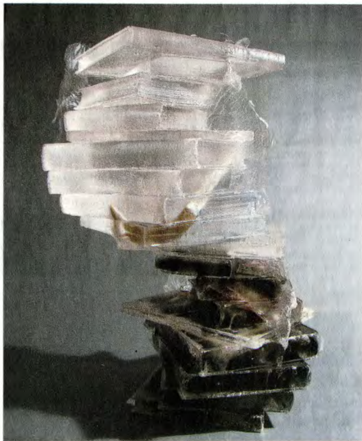
Talley Dunn Gallery

He created in cast bronze the dramatic sculpture just inside the main entry of the Modern Art Museum of Fort