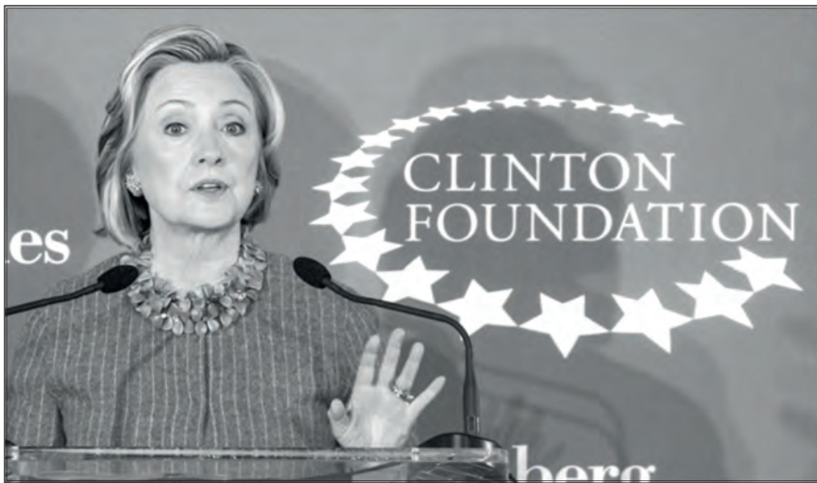
Hillary Rodham Clinton—Clinton Foundation

each others' political efforts by accessing private phone records, computer search engines and/or wide-reaching intercepts and surveillance activity, or controlling and making up data, or dossiers to favor certain political parties and entities, along with spying on world leaders that are supposed to be your friendly allies, and meddling in foreign civil unrest—it becomes a stunningly disappointing reality check of abandoned honesty, integrity, and respect for the rule of law.