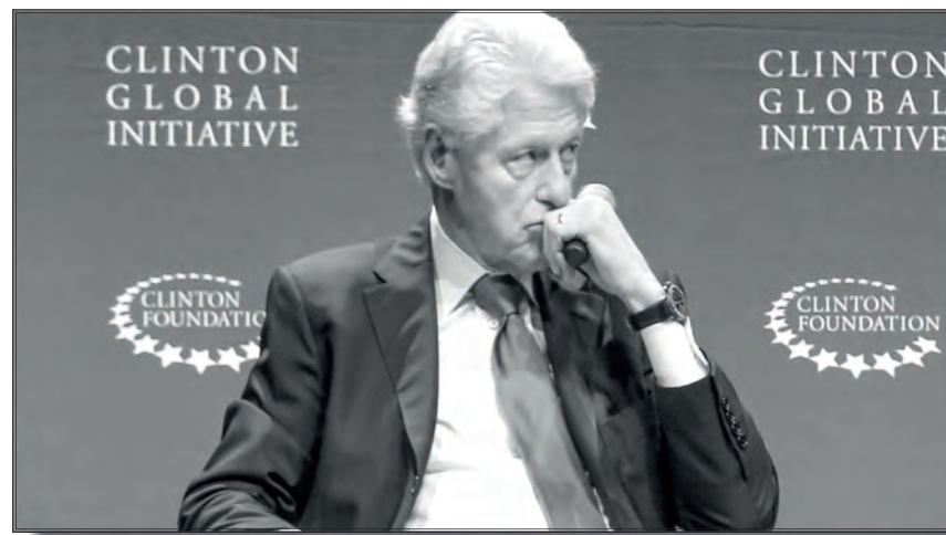
William Jefferson Clinton—Clinton Global Initiative