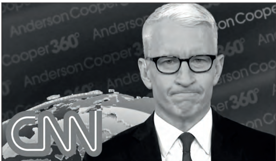
Anderson Cooper—CNN Anchorman

In addition, "And when you see Jerusalem compassed with armies, then know that the desolation thereof is near" (Luke 21:20). It goes on to