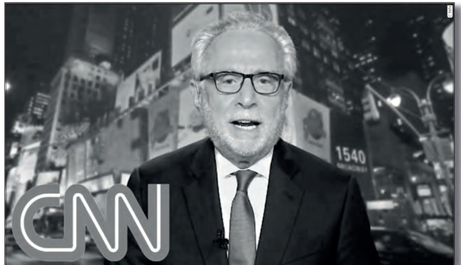
Wolf Blitzer—CNN Reporter