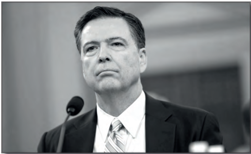
Former FBI Director, James Comey