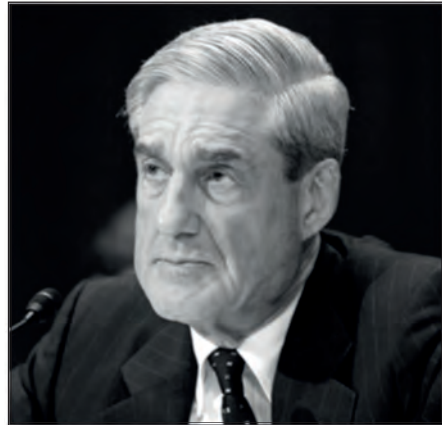
Robert Swan Mueller—Former FBI Director, Named Special Counsel for Russia Investigation

say that if you're in that area, get out, and if you're not in that area, stay out. Don't go to the Middle East (verse 21)! Don't believe and don't be deceived by those claiming to know Christ and then advise you to go to the Middle East for safety and protection— that's nonsense! Jesus says, "...and let not them that are in the countries [in and around the area] enter thereinto" (Luke 21:21). In other words, STAY OUT OF THE AREA!