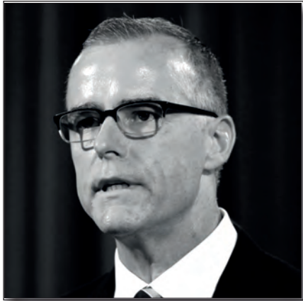
Andrew McCabe—Deputy Director of the FBI