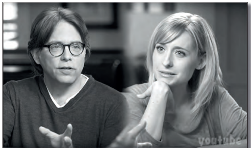
Keith Raniere and Allison Mack—Cult Leaders