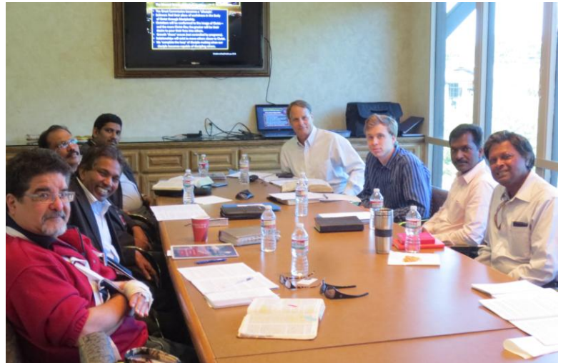
Indian Pastors attend the GFL course in Disciple-making