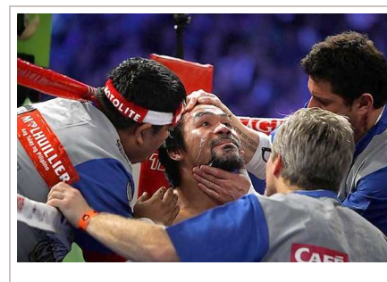
Pacquiao knocked out by Marquez in sixth round