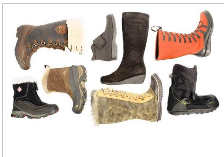
Winter boot showdown