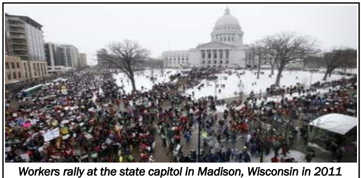
Workers rally at the state capitol in Madison, Wisconsin in 2011

So, in face of this dismal scenario, what are unions & rank and file workers to do? Let’s look at what happened in Wisconsin six years ago, when a right-wing anti-worker state government mounted such an assault. Workers and their allies rose up in what was a powerful movement, occupying the state capitol for weeks, building an alliance of workers (both public and private sector), farmers, students, the poor, and others while conducting massive demonstrations (at times reaching well over 100,000 participants) and winning broad popular support. Nevertheless, they lost, suffering the first of what would be a series of labor defeats in Midwestern states in the months and years to follow. Why did they lose?