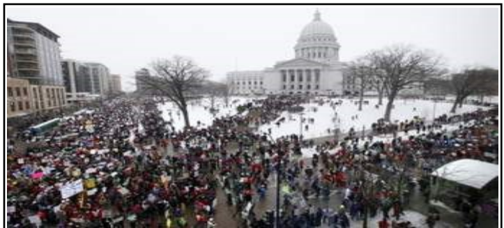
Workers rally at the state capitol in Madison, Wisconsin in 2011

So, in face of this dismal scenario, what are unions & rank and file workers to do? Let’s look at what happened in Wisconsin six years ago, when a right-wing anti-worker state government mounted such an assault. Workers and their allies rose up in what was a powerful movement, occupying the state capitol for weeks, building an alliance of workers (both public and private sector), farmers, students, the poor, and others while conducting massive demonstrations (at times reaching well over 100,000 participants) and winning broad popular support. Nevertheless, they lost, suffering the first of what would be a series of labor defeats in Midwestern states in the months and years to follow. Why did they lose?