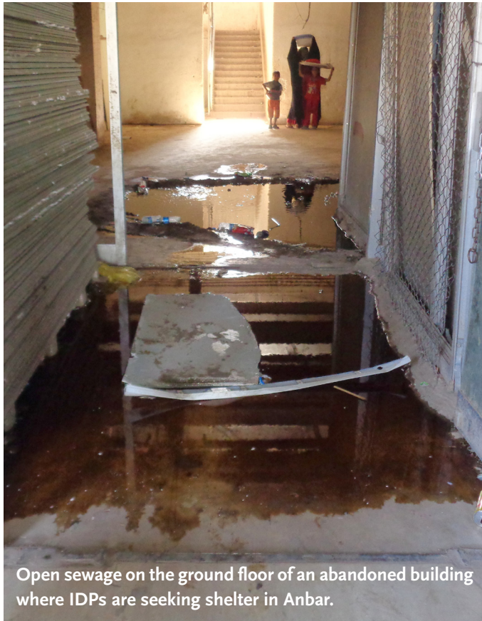
Open sewage on the ground floor of an abandoned building where IDPs are seeking shelter in Anbar.