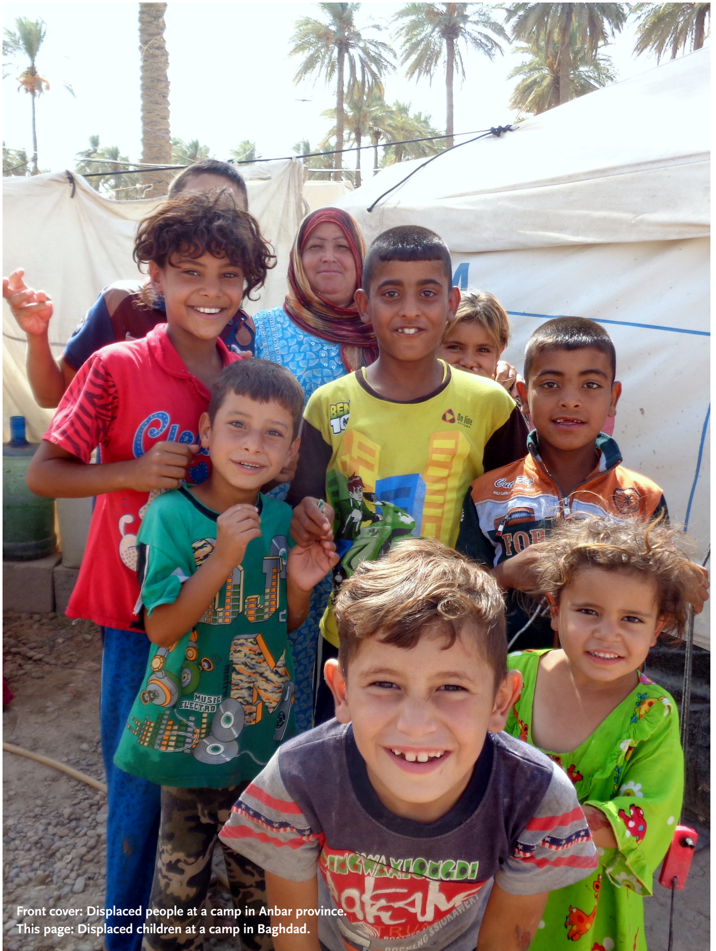
Front cover: Displaced people at a camp in Anbar province. This page: Displaced children at a camp in Baghdad.