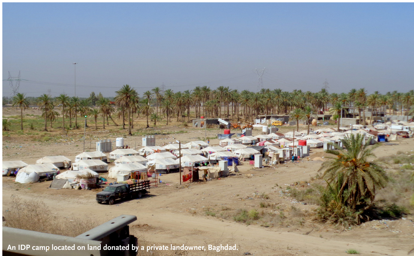
An IDP camp located on land donated by a private landowner, Baghdad.

The camp is managed by an energetic team of IDPs who do their best to solve problems, but the lack of presence of the Iraqi government, the UN, and INGOs made it practically impossible for the camp to meet even basic humanitarian standards. And the reality is that that lack of presence is due in significant part to security concerns. In addition to being in Anbar province generally, where ISIS controls large chunks of territory, its location between Ramadi and Fallujah puts it uncomfortably close not only to ISIS territory but also to the ongoing violence in both those cities. One INGO with a long history of programs in Anbar told RI that it no longer sends westerners into the province for their own safety. With organizations feeling so cautious about who can reasonably travel to such an area, and with actual fighting happening so close by, it is not surprising that humanitarian aid is in short supply. It is, however, a problem that must be remedied.