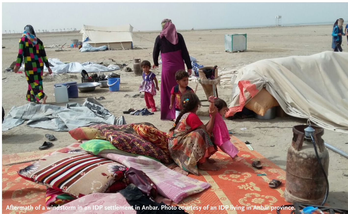
Aftermath of a windstorm in an IDP settlement in Anbar.

The members of the provincial council talked to RI about the challenges they faced in supporting the IDPs. In theory, they were supposed to get assistance from the central government for supporting the IDPs, but in practice there was little useful communication between the two. The displaced were allowed into the town’s local systems—health care, for example—but it was difficult to accommodate the large numbers of new