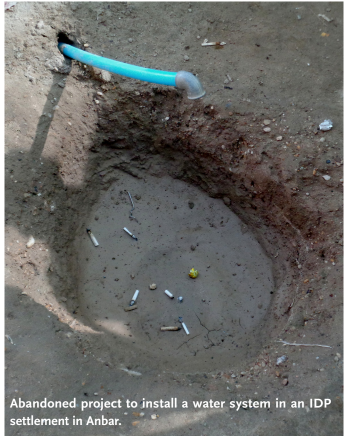
Abandoned project to install a water system in an IDP settlement in Anbar.