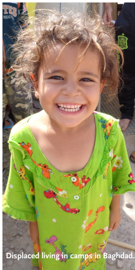
Displaced living in camps in Baghdad.