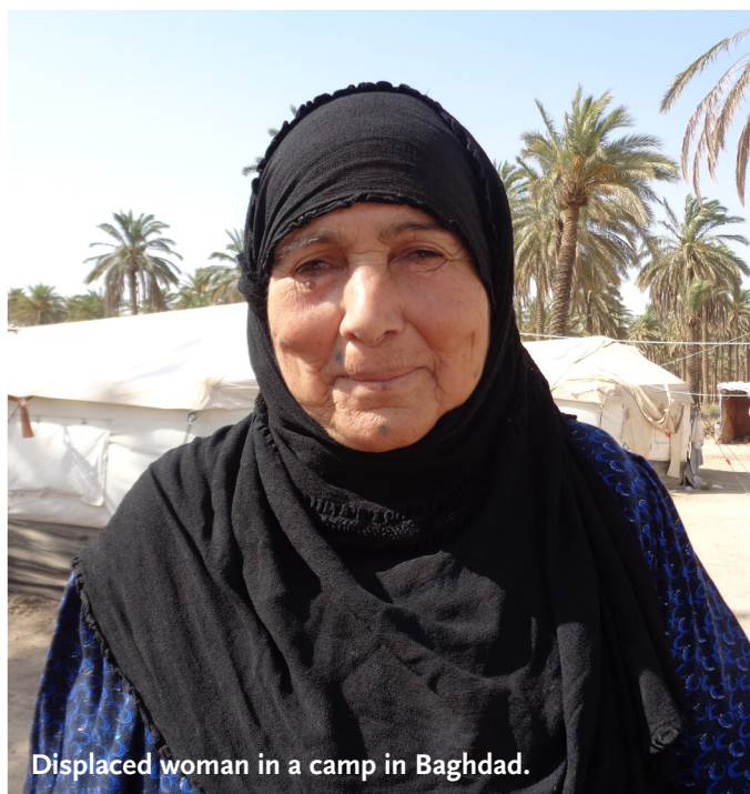
Displaced woman in a camp in Baghdad.

For two years now, the humanitarian assistance that has reached people in central and south Iraq has been sporadic and inadequate. After agencies moved their centers of operation out of Baghdad in 2014, it became more difficult for them to do a first-hand assessment of the needs on the ground and to plan an approach to aid delivery. While the whole-of-Iraq approach was recognized as essential, the coordination meetings that happened in Baghdad were difficult and expensive for KRI-based staff members to attend, and the few groups that remained based in Baghdad did not have the combined resources to do a