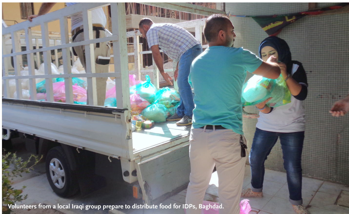
Volunteers from a local Iraqi group prepare to distribute food for IDPs, Baghdad.

people who needed services. One of the council members explained how he would sometimes personally refer people into the medical care process in order to get them attention in a timely manner even if they could not afford it.