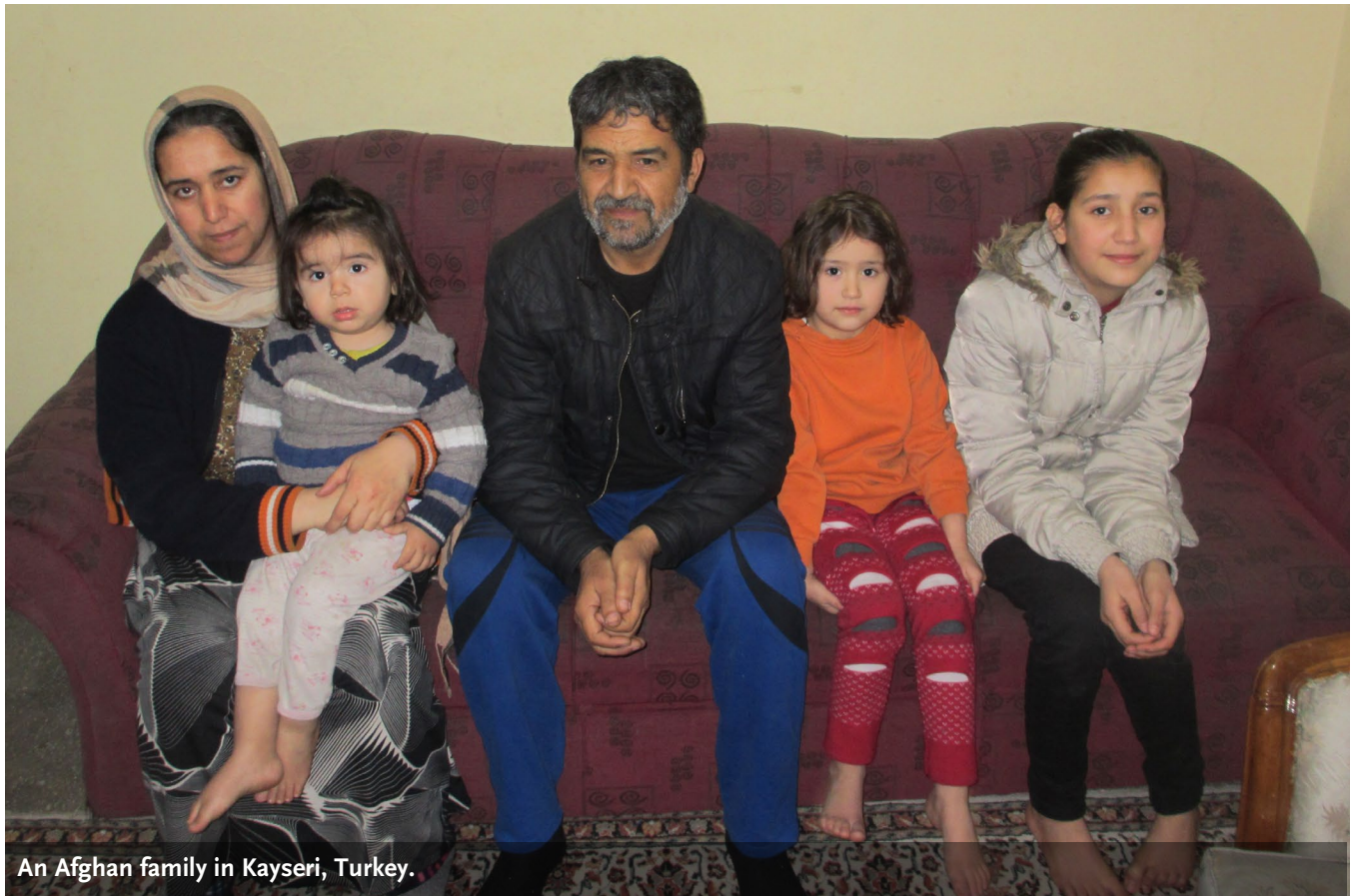
An Afghan family in Kayseri, Turkey.

was dressed as a woman. “Ten days after I came to Turkey, I was forced to live like a boy again... I understood no one will rent a house to me, so I changed to boy’s clothes. Within one hour, they gave me a room. It made me feel awful,” she said.