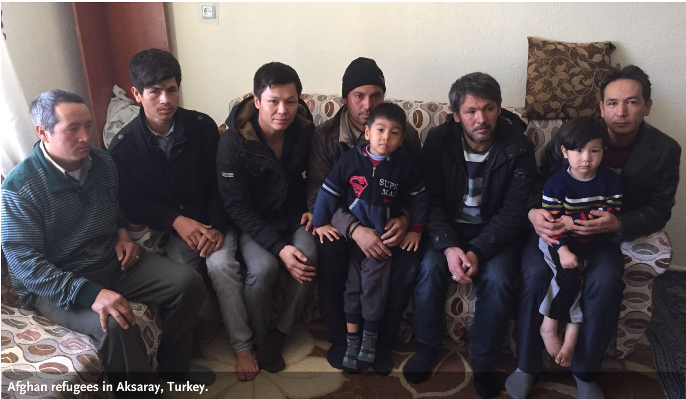
Afghan refugees in Aksaray, Turkey.