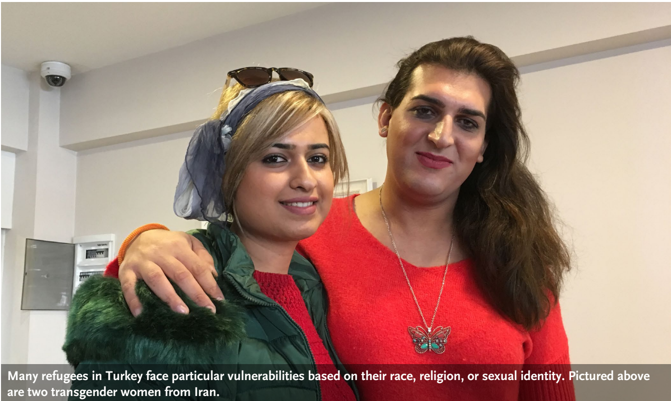
Many refugees in Turkey face particular vulnerabilities based on their race, religion, or sexual identity. Pictured above are two transgender women from Iran.