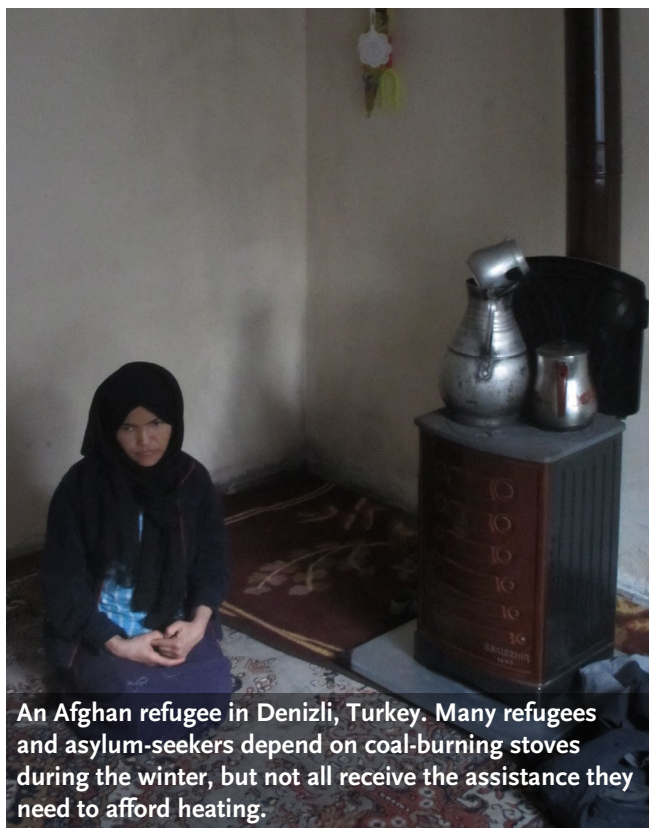
An Afghan refugee in Denizli, Turkey. Many refugees and asylum-seekers depend on coal-burning stoves during the winter, but not all receive the assistance they need to afford heating.

While the winterization program is an important effort to help refugees during the winter months, many people who need assistance are excluded from its scope due to the limited number of beneficiaries and to the exclusion of asylum-seekers. As for the other eligibility criteria, most of the refugees and asylum-seekers of non-Syrian nationality interviewed by RI fell into at least one of those categories. The Turkish Government also has winterization programs which benefit some refugees and asylum-seekers, but these are also limited. Furthermore, while RI