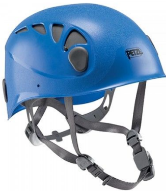
Ex.1: Petzl Elios, a hard plastic climbing helmet.

Climbing helmets are either hard plastic (ex. 1) or foam (ex. 2), both are acceptable. Hard plastic helmets are cheaper and far more durable, foam helmets are lighter and offer better ventilation for skiing in hot conditions (common at JIRP). JIRP has a number of hard plastic helmets to rent if you don't already own one. Helmets not rated for climbing (single-purpose ski helmets, bike helmets, etc.) are not acceptable. If you bring your own foam helmet, pack it carefully. Rough handling of luggage has cracked foam helmets en route to JIRP.