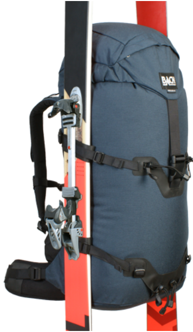
Fig 1. Side view of skis strapped to backpack. Note backpack side straps for skis. These are not the recommended backpack or skis, but merely an illustration of the strap use.