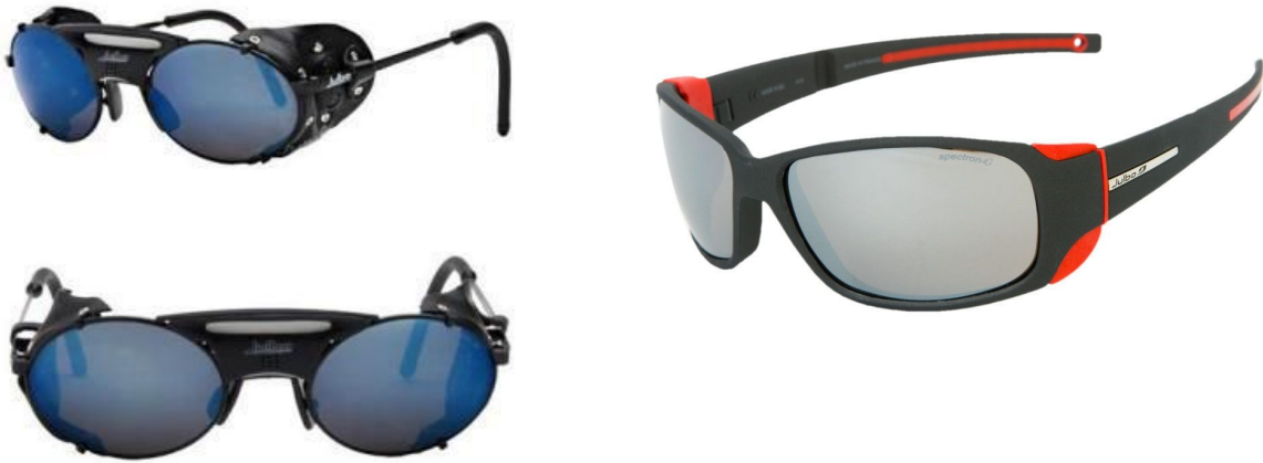
Good examples of glacier glasses.