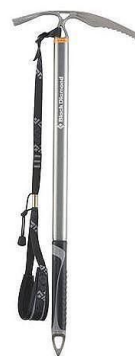
Example #2: Black Diamond Raven