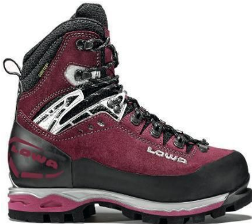
Ex. 3: Lowa Mountain Expert GTX