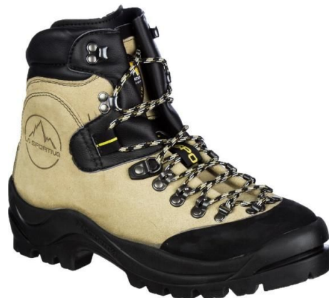
Ex. 4 LaSportiva Makalu