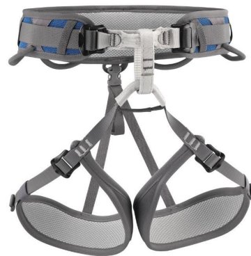
Ex. 2: Petzl Corax harness (padded)