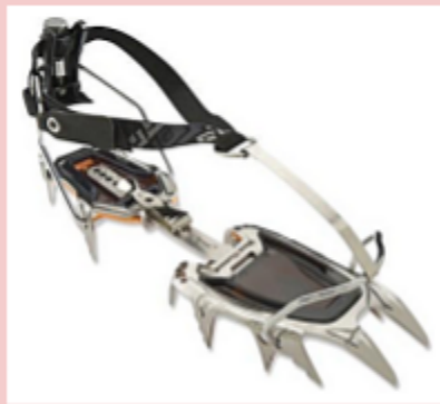
Ex #2: Automatic crampon

We do not allow “automatic” (steel wire bail at the toe and heel, ex. 2 below) or “semi-automatic” (steel wire bail at heel, rubber strap at toe, ex. 3 below) crampons. These are much more likely to cause fit issue with either your hiking boots or your ski boots.