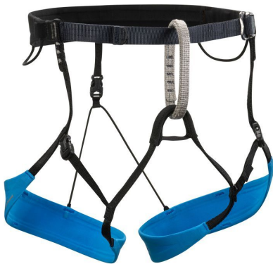
Ex. 1: Black Diamond Alpine Couloir (not padded)

A climbing harness that has a belay loop, adjustable leg loops, and gear loops. Fully detachable leg loops are a nice feature to have because they make the harness easier to put on over boots. If you plan to use the harness for rock or ice climbing after the program, waist belt and leg loop padding make the harness significantly more comfortable; for our traverse padding isn't required and harnesses without padding are more comfortable when wearing a backpack. The Black Diamond Couloir (ex. 1, not padded) and the Petzl Corax (ex. 2, padded) harnesses or similar are ideal. Make certain it is the correct size: both snug enough over just a t-shirt/thin pants and not too restrictive over several layers of warm clothing. If you can pull your harness down over your hips it is too big. More info on choosing an appropriate model and size here (the ski mountaineering option is best for JIRP, although any harness will work): https://www.youtube.com/watch?v=MHV-mr2VD-0 . Harnesses have a lifespan of about three - five years and knowing the history of the harness (how many falls it's had on it, how it's been stored, etc.) is important. Avoid hand-me-down harnesses.