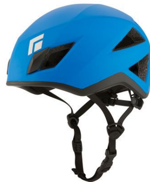
Ex. 2: Black Diamond Vapor, a foam climbing helmet.