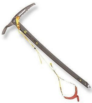
Example #1: Grivel G1+

Mountaineering style. Lengths range from 50-65 cm, sized by height. Must have a "B" or "T" rating and a steel or chromoly shaft (no aluminum). Ice axes designed for technical ice climbing and hybrid ski pole/ice axes ("whippets") are prohibited.