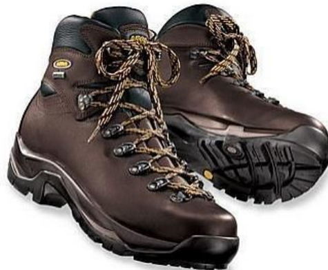
Ex. 2: Asolo TPS 520 GV