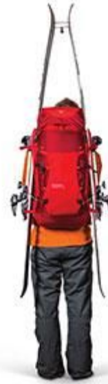
Fig 2. Rear view of skis strapped to backpack (secured with a rubberised ski strap at the top)