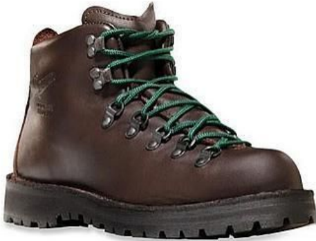
Ex. 1: Danner Mountain Light II GTX

Above-the-ankle, medium-weight, with a vibram-type lug sole. You will be hiking on snow, ice, sharp frost-shattered rocks, mud, loose and unconsolidated rocks and gravel, and across several streams. We strongly recommend leather or soft synthetic hiking boots or light-duty mountaineering boots instead of hard plastic mountaineering boots because soft boots provide better flexibility and traction on rock. Asolo, La Sportiva, Merrell, Scarpa, and Vasque are some well-known and reputable brands, but there are many others. Some boots have built-in Gore-Tex liners – we recommend these to cope with the wet conditions. Boots have a long lifespan, used options are acceptable here but check to see if they need to be resoled or restitched. Boots should be large enough for two pairs of socks (thick socks and liner socks). Work boots are prohibited because they do not provide adequate traction or support on rock.