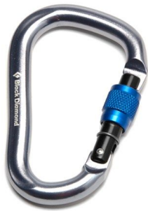
Locking carabiner: (the bright blue piece is the lock)