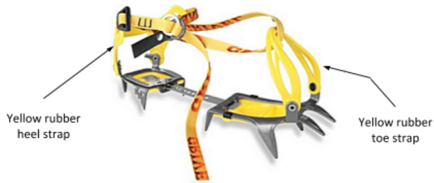
Example 1: Grivel G-10, strap-style, 10-point mountaineering crampons.

Your crampons must be “strap style”. These can accommodate most hiking and ski boots because they use flexible rubber straps at the toe and heel (ex. 1 below). Other styles, with steel wires at the toe and/or heel, are often incompatible with either your hiking boot or your ski boot. Your crampons need to be compatible with both sets of boots.