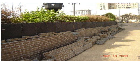
Typical damaged brickwork that was restored