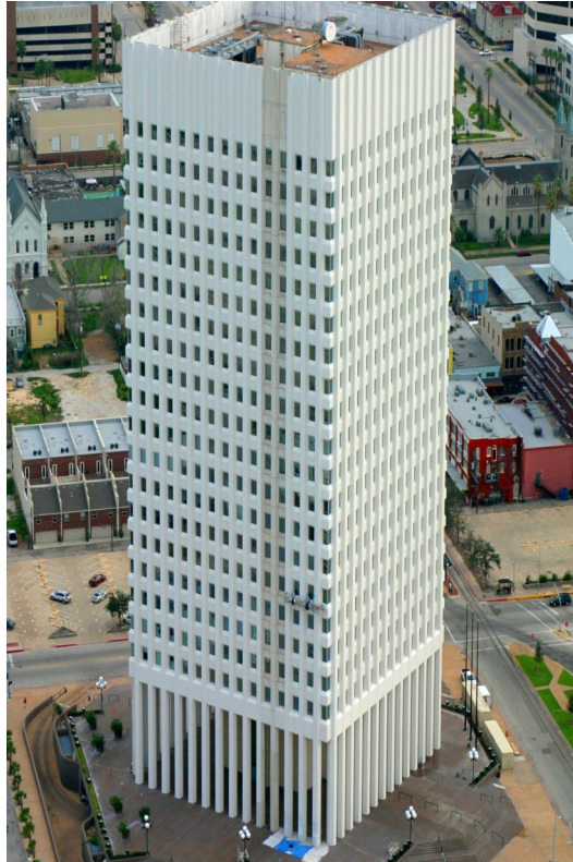
In Progress Photo Of Project

All damaged brick of the retaining walls and penthouse were removed and reset with matching brick which were manufactured locally