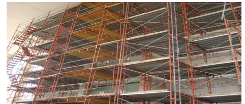
Walls had scaffolding set up to replace the marble.