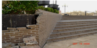
More damaged brickwork that was restored