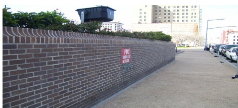
Completed brickwork after being restored