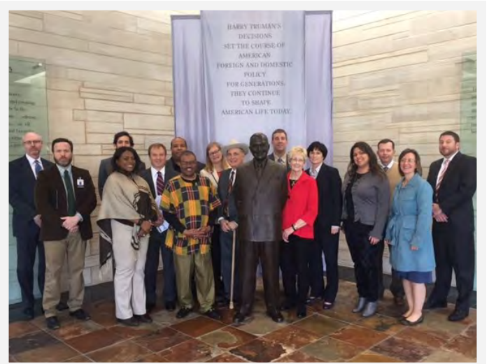
The 2015-2016 EPFP program included a visit to the Harry S. Truman Presidential Library, where fellows participated in a simulation at the White House Decision Center.

The Missouri-Kansas Education Policy Fellowship Program is sponsored by: