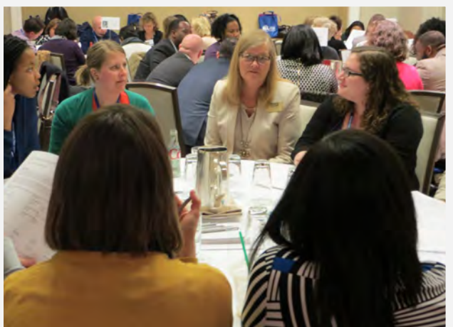
EFPF fellows from around the country met in Washington, D.C., for the 2016 Washington Policy Seminar on Presidential Politics and Education Policy.