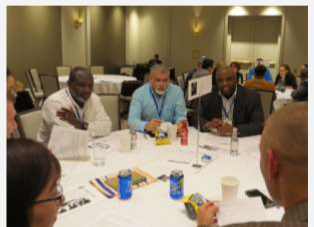
EPFP fellows from around the country met in Washington, D.C., for the 2017 Washington Policy Seminar on Navigating Education Policy Change.