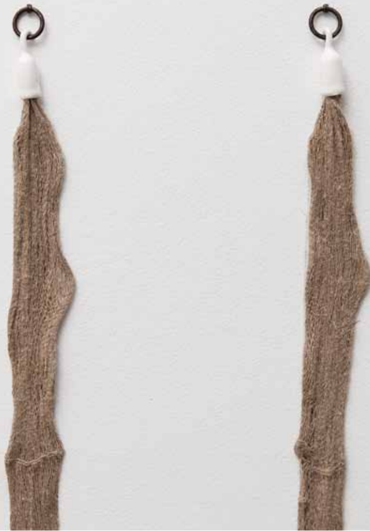
Beth Stuart, Stanchions for E.H./Immanent collapse , 2012, spranged linen, porcelain, iron hooks, gesso, acrylic paint, image courtesy the artist, photography: Paul Litherland.

dictate where they are placed and how they relate to each other – and how we relate to them. Stuart is a seeker of liminal states, which have multi-tiered suggestions for the reading of her work.