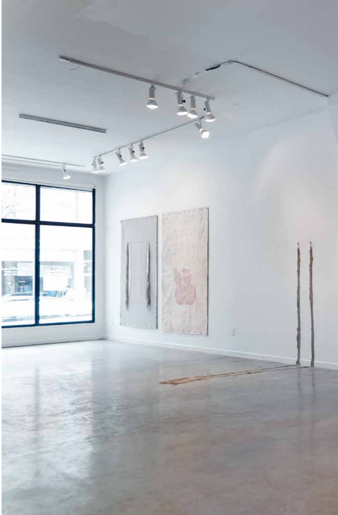
Beth Stuart, Installation view, What Bonds Are These? , La Centrale Galerie Powerhouse, image courtesy the artist, photography: Paul Litherland.