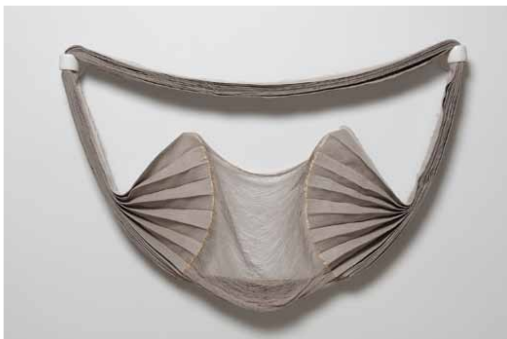
Beth Stuart, But a weak smile , 2012. Commercial artist's linen (weft partially removed, warp spranged, remainder pleated), gesso, gold leaf, unique glazed porcelain stanchion hardware, image courtesy the artist, photography: Paul Litherland.