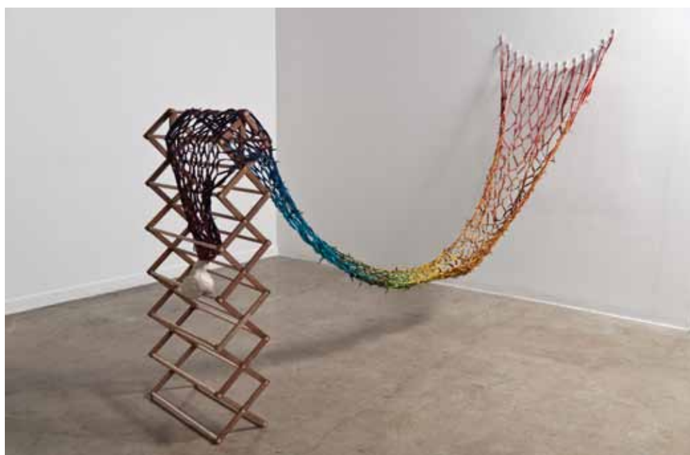
Beth Stuart, Stanchions for E.H./Thingdu , 2012. Spranged handcut leather, maple, walnut, unique porcelain vessel, unique glazed porcelain hooks.