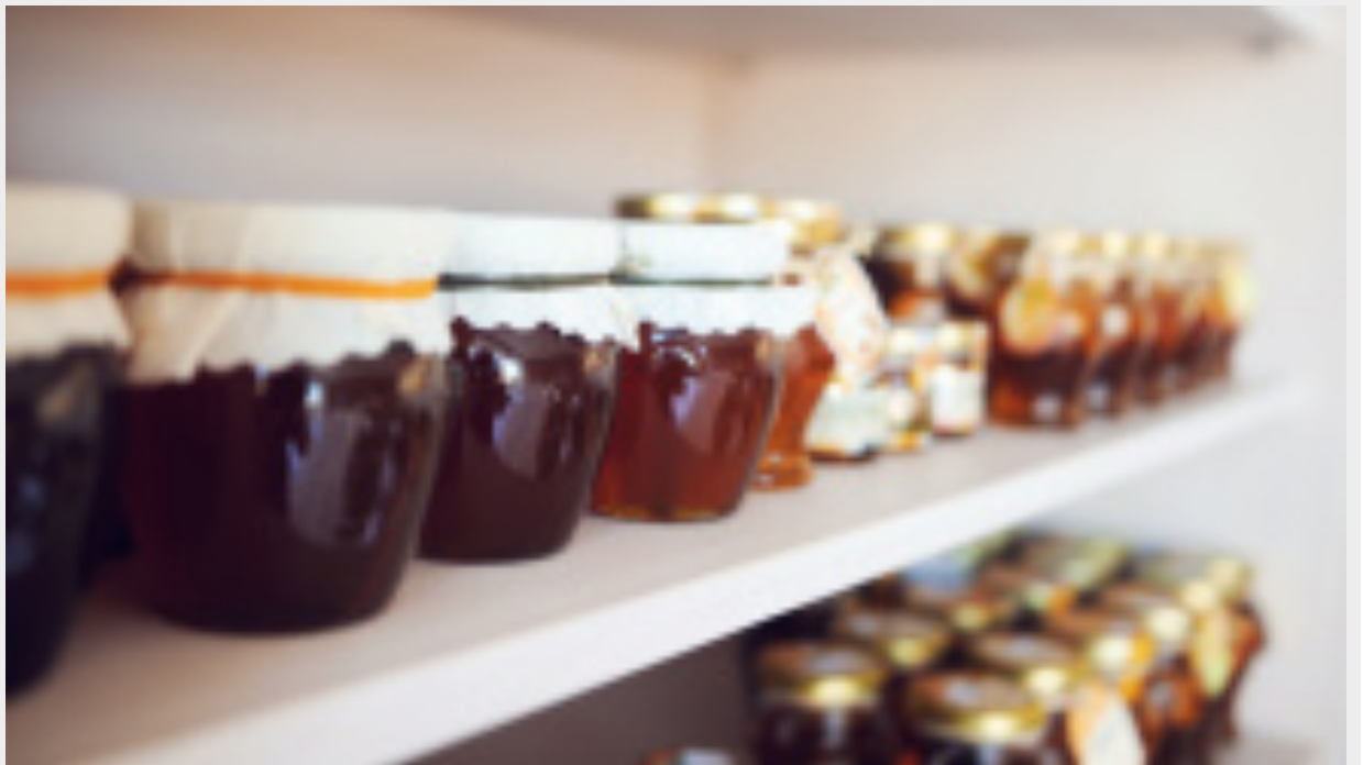
Farm Fakes: A History of Fraudulent Food