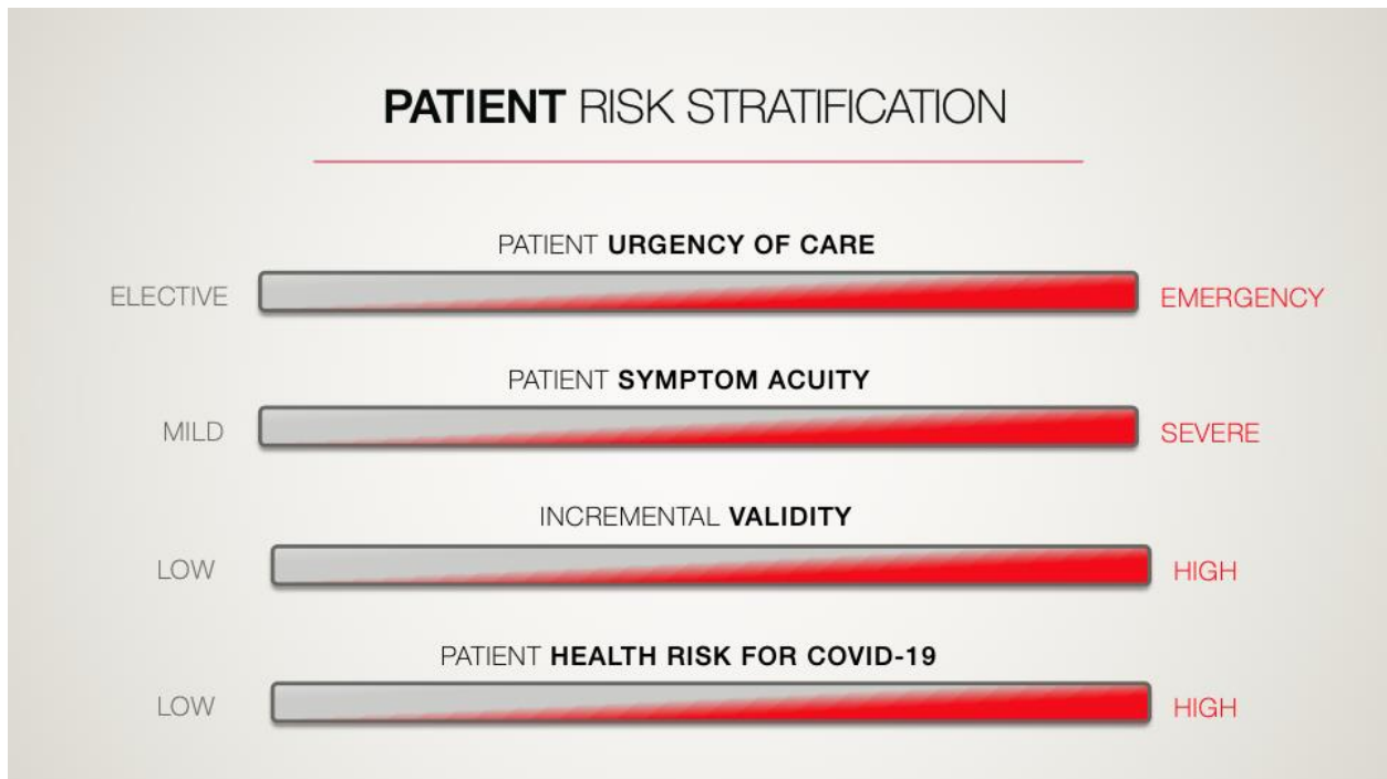
Figure 1. Patient Risk Stratification

Considering the benefits of neuropsychological assessment in the context of the risks of in-person practice during the pandemic, as mitigated by the various models for assessment noted above, is a complex process, and involves at least four different factors.